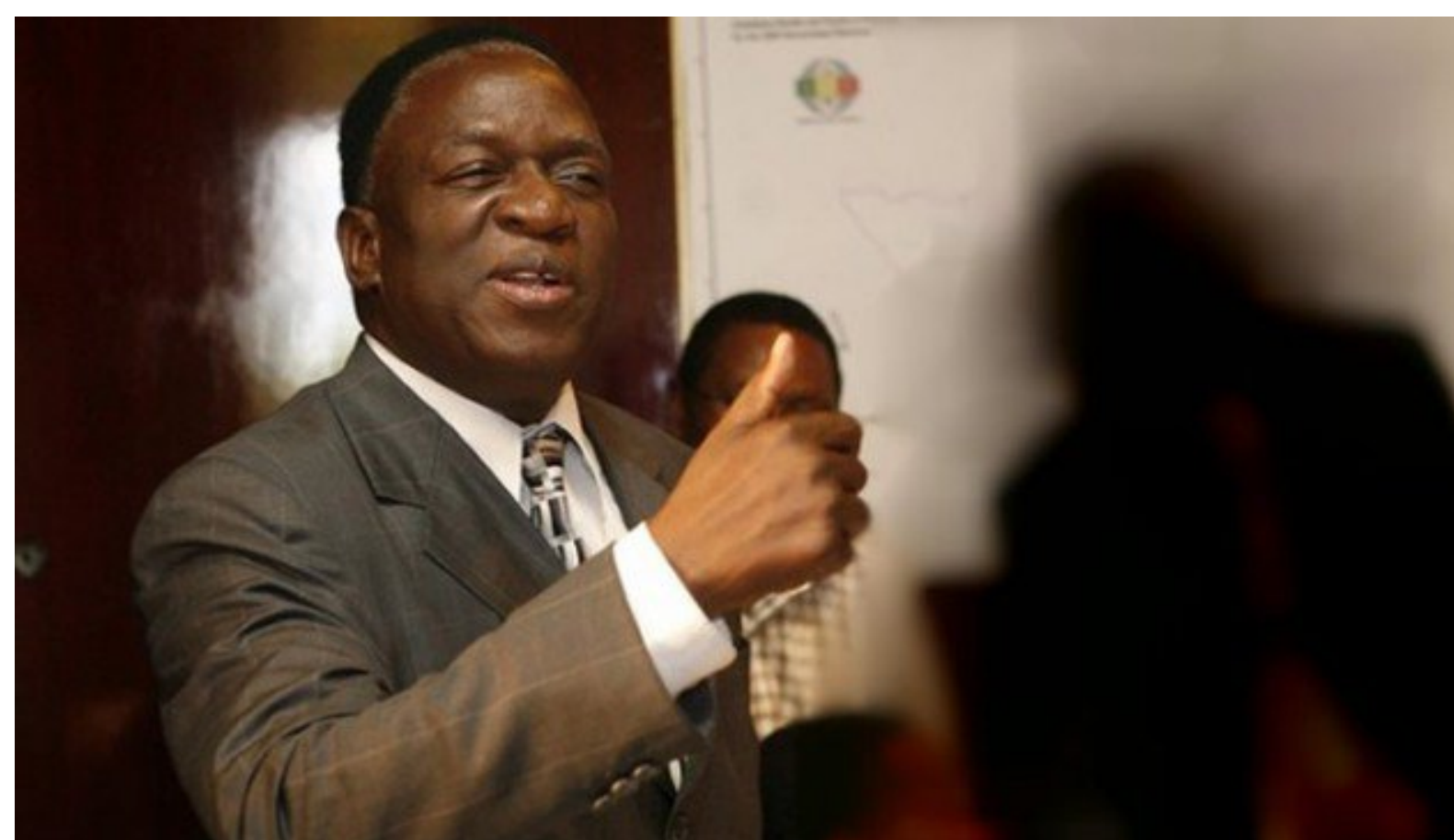
Acting President Emmerson Mnangagwa