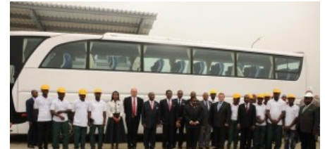
EQUATORIAL GUINEA INAUGURATES PIONEERING CNG PLANT