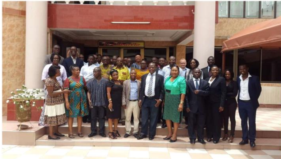
Participants at the Ghana beneficial ownership meeting in Dodowa

to another, can often make identifying the beneficial owner of a company a difficult task.