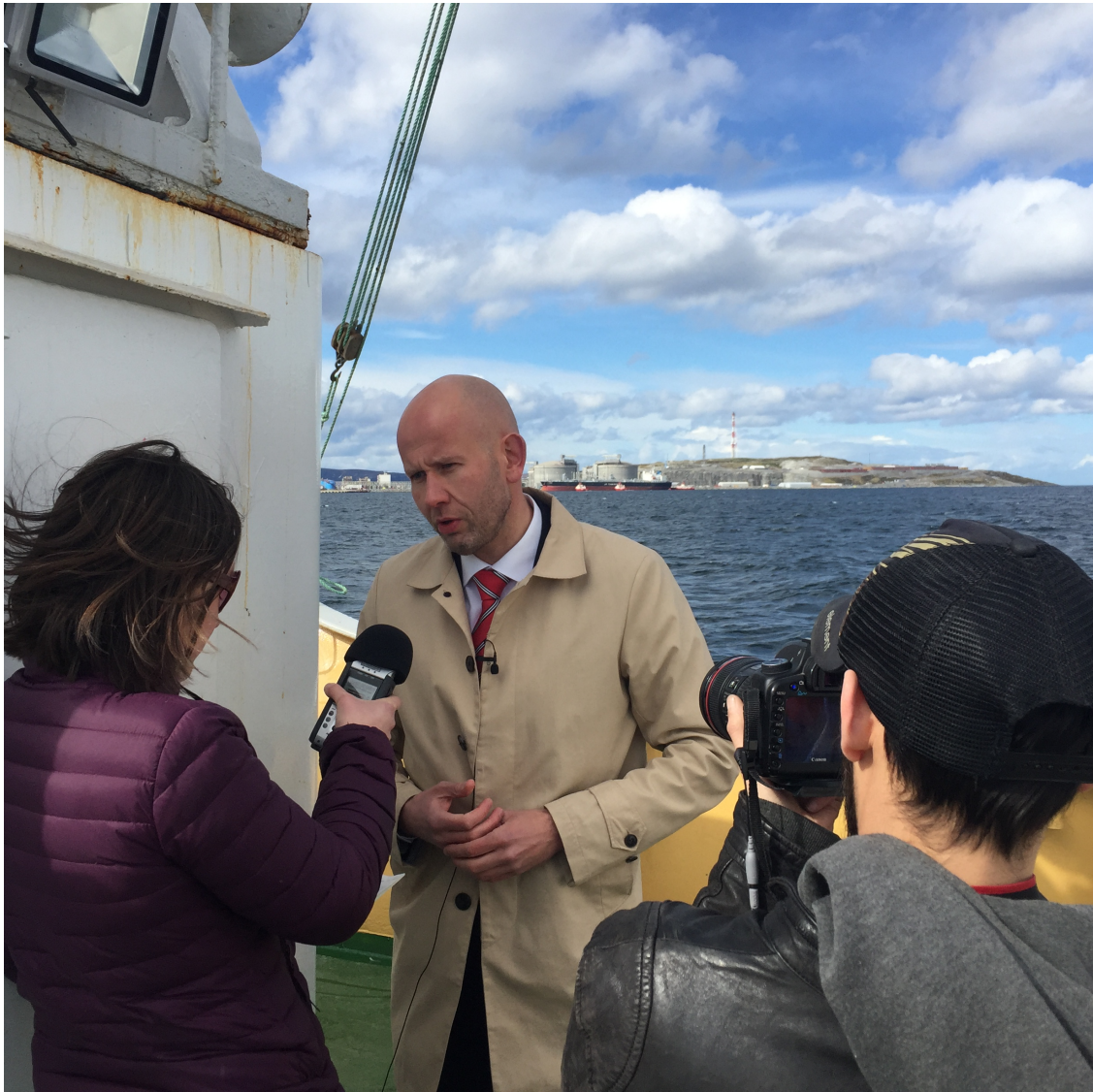
Zoom in on image