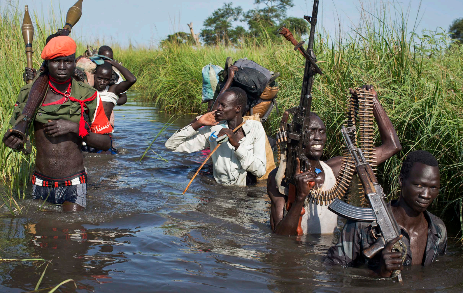
Rebels soldiers patrol and protect civilians from the Nuer ethnic group as they wade to reach a UN camp. 1.7 million South Sudanese citizens have been displaced, and 4 million face alarming food insecurity as a result fighting.

This report presents the results of research and analysis into the company and the deal. In the process of this research Global Witness has been provided with documentation currently not on the public record by Star Petroleum. The government of South Sudan itself has also requested and been given, in accordance with the law, additional information by the company. This is a positive step. Global Witness is now calling on the government and the company to make this information public, so that parliamentarians, civil society and ordinary citizens are able to scrutinize the deals being done on their behalf.