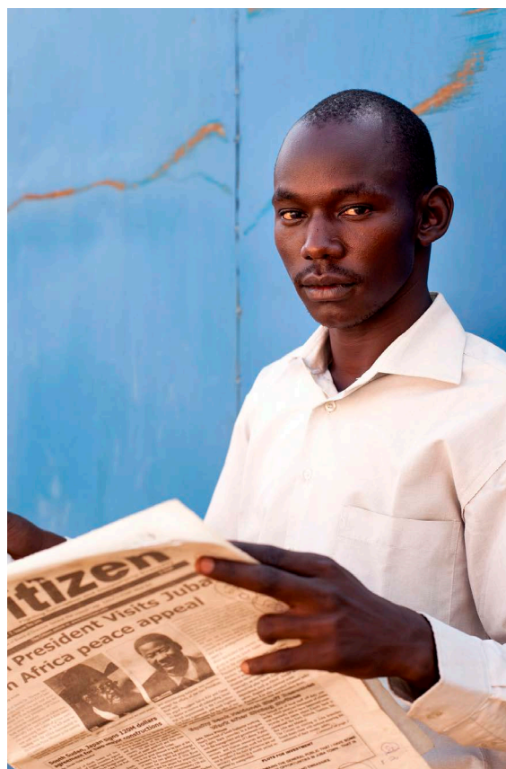
Information about the deal for block E should be made public, and readily accessible. That way, South Sudanese citizens can see and discuss the terms their government are negotiating for their resources. (Credit: Crispin Hughes/Panos Pictures).