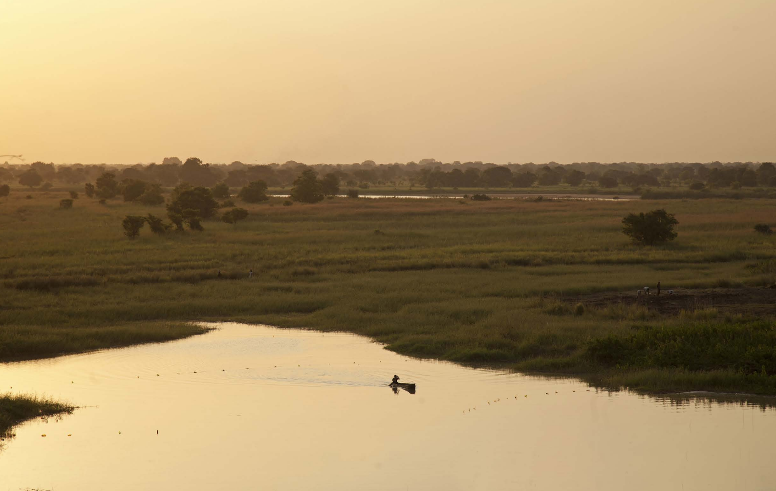
A fisherman traverses the swamps in Northern Bahr El Ghazal state, South Sudan. This state is one of four crossed by block E's concession area. (Credit: AWL Images/Getty Images).

Another concern is that Star Petroleum has no operating assets anywhere in the world. The company owns the rights to two blocks in the Iranian Caspian but has conducted no activity on these concessions as a result of the UN sanctions regime. 17 The fragile social and environmental context presented by South Sudan demands that any company entering the sector must have the appropriate technical experience and competence to ensure that oil production does not lead to further disruption and damage. South Sudanese law acknowledges this, making requisite technical competence and sufficient experience requirements for contractors. 18