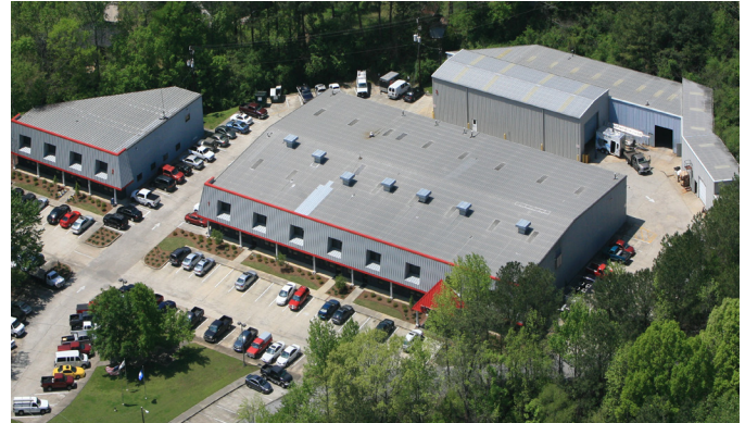
Facilities include approximately 64,000 square feet of production and engineering space in Birmingham

We are committed to risk mitigation for our customers. This is accomplished through a combination of breadth and depth of industry and equipment expertise, financial strength, certifications and standards, scalable services, and a collaboration portal for sharing project information.