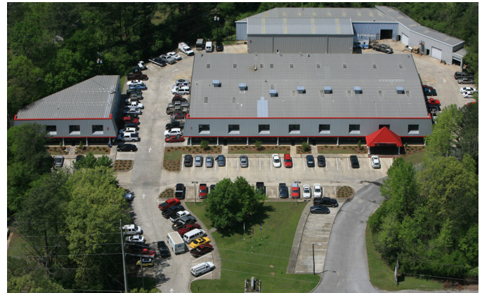
Facilities include approximately 64,000 square feet of production and administrative space

We provide things many other system integrators don't; like full simulation testing prior to shipment and a comprehensive documentation package. All job information, including drawings and O&M manuals, is available 24/7 through our web-based extranet system. And in addition to being CSIA Certified, we have also attained "solution provider" status with major hardware and software suppliers.