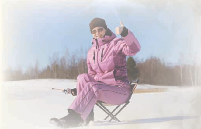
PGC Photo Credit

The workshop is held in the beautiful wilderness setting of Chapman State Park and will include outdoor and cabin fever activities.