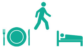
Take care of your body through fuel, movement, and rest