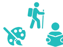
Do something you enjoy