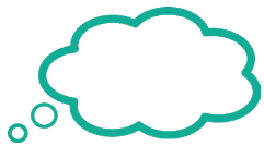
Be thoughtful about the substances you put in your body