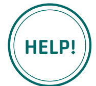
Ask for help when you need it