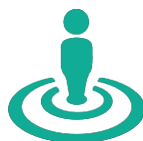
Set healthy boundaries