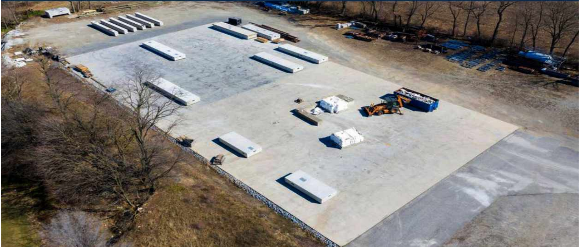
CONCRETE PAD AREA FOR STORAGE / STAGING