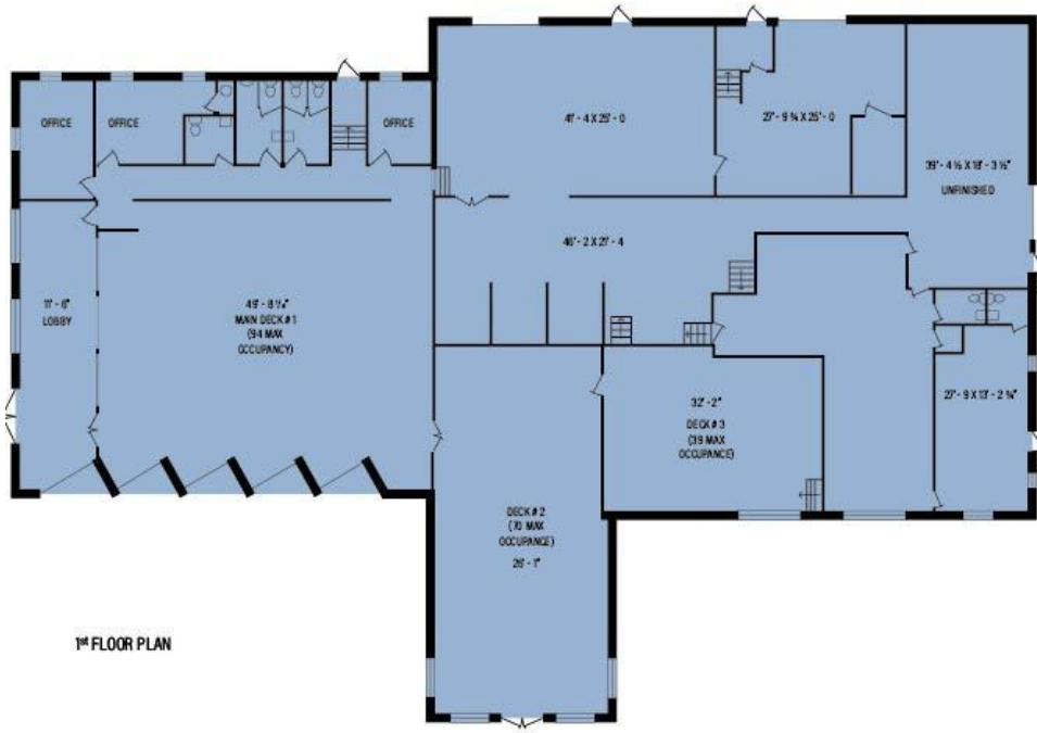
1 st FLOOR PLAN