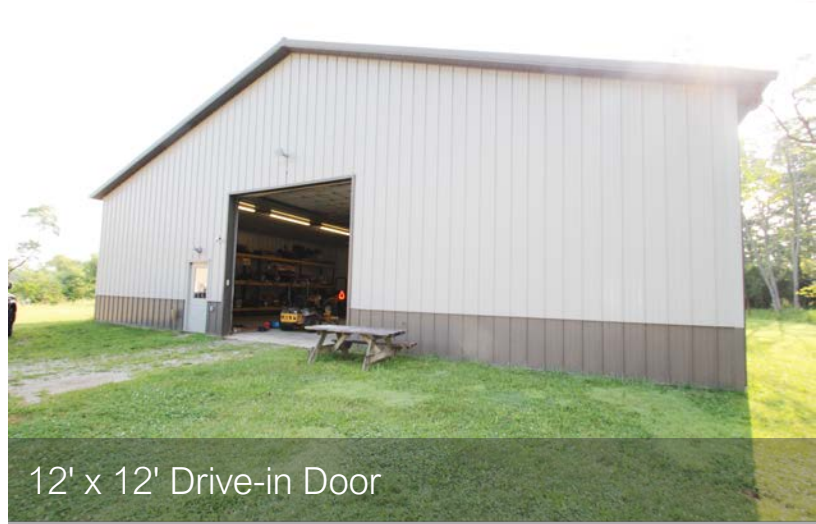
12' x 12' Drive-in Door