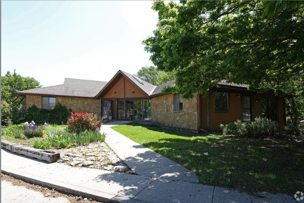
Value Add Building