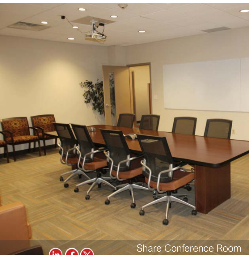
Share Conference Room