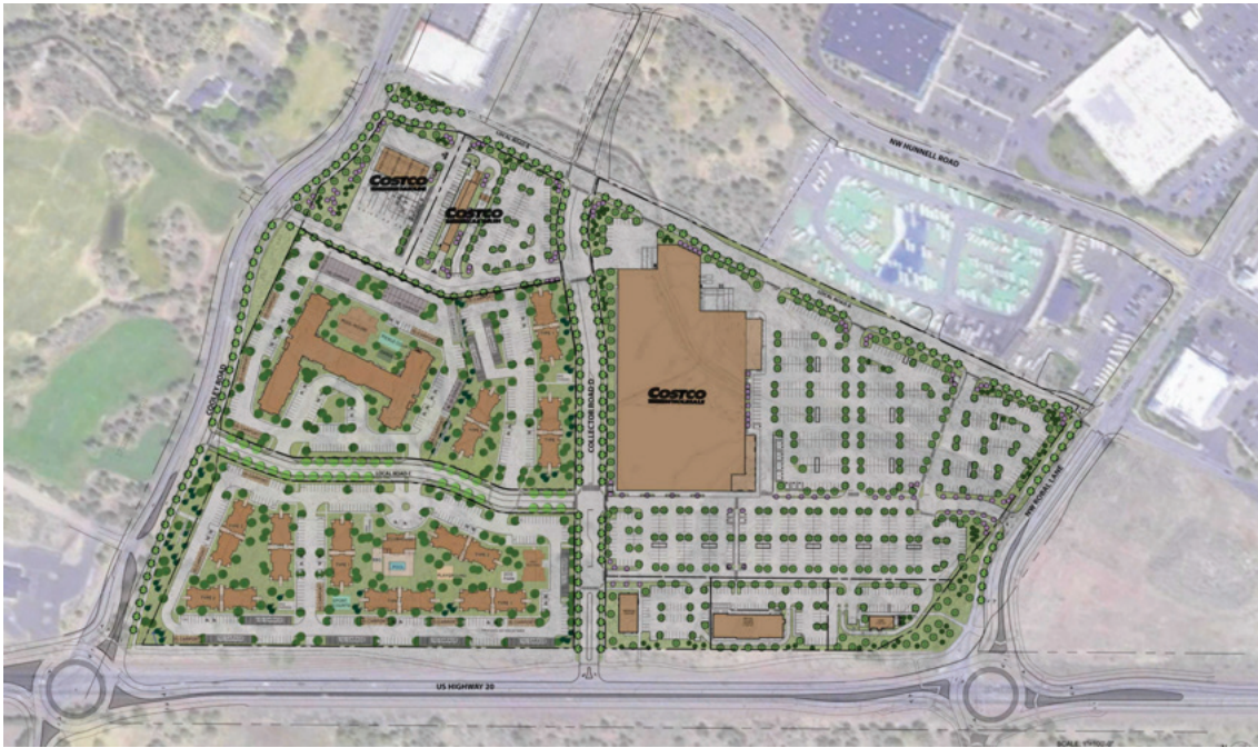
Future Costco development site plan