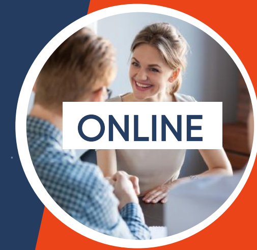
CONVERSATIONAL AI IN HR SUMMIT