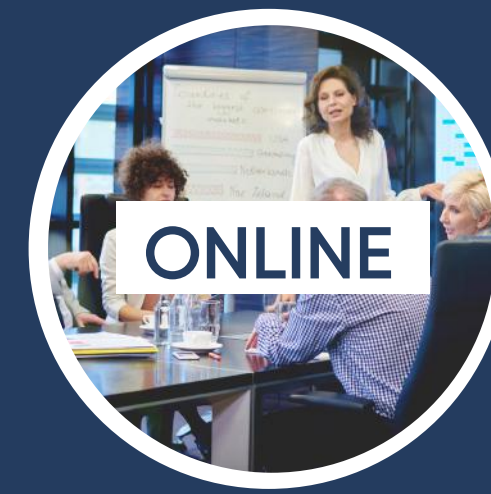
ENTERPRISE AI SUMMIT