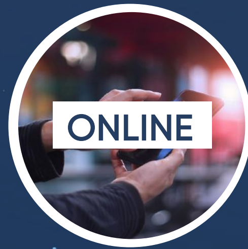
CONVERSATIONAL AI IN BANKING SUMMIT