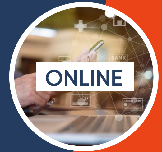
AI ETHICS SUMMIT