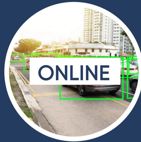
DEEP LEARNING APPLICATIONS SUMMIT