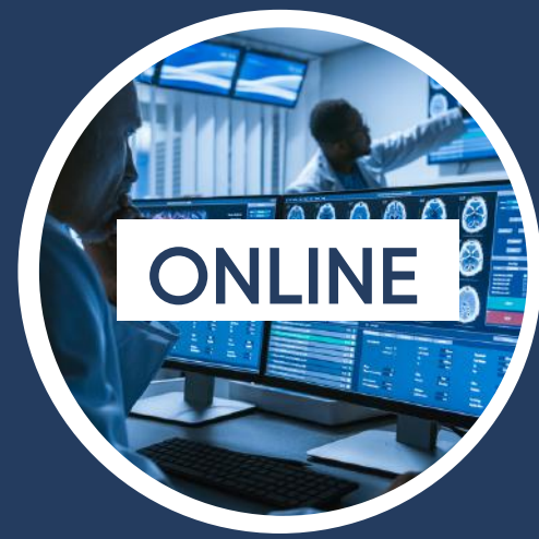
DEEP LEARNING RESEARCH ADVANCEMENTS SUMMIT