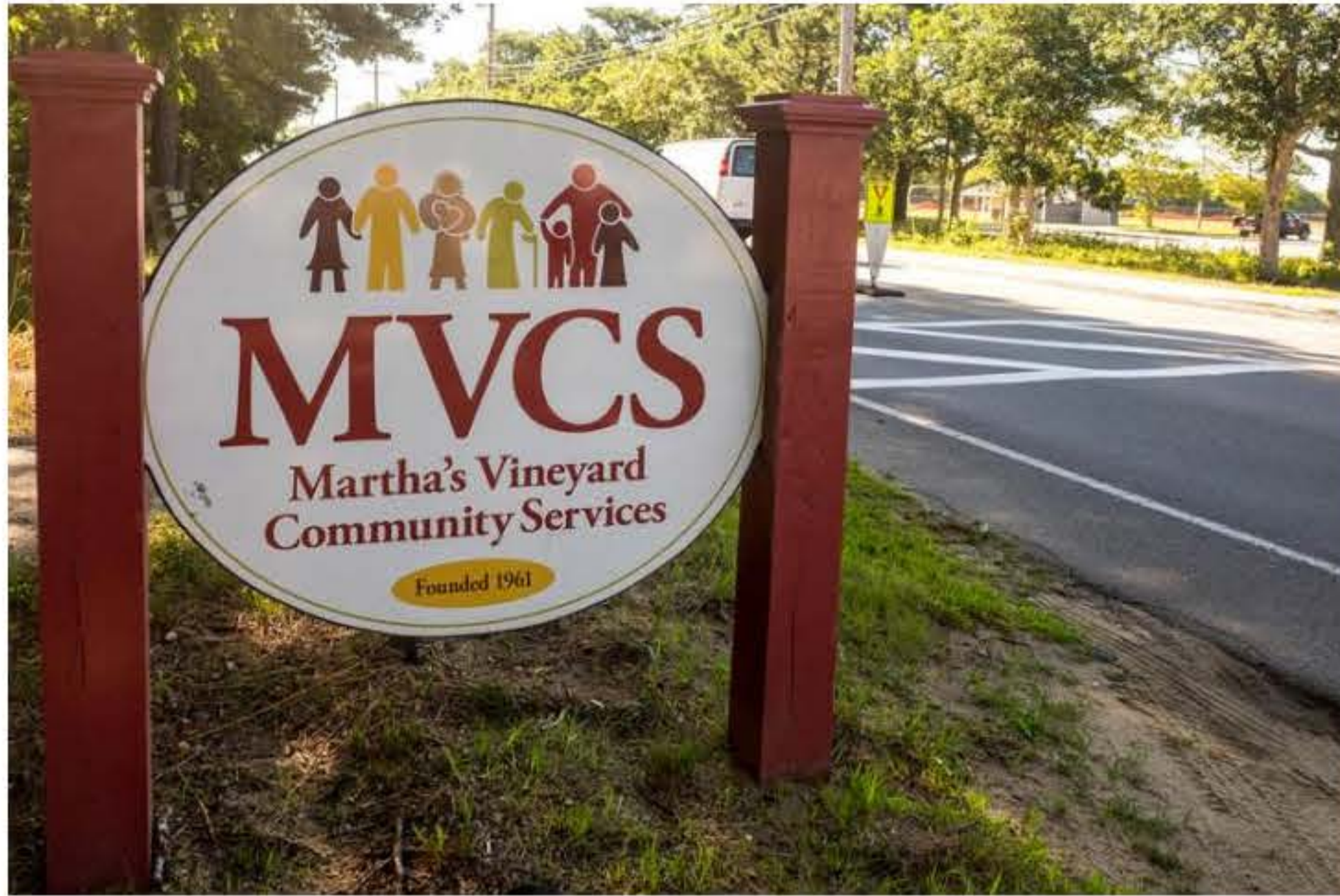
Possible Dreams auction is July 30 to benefit Community Services.