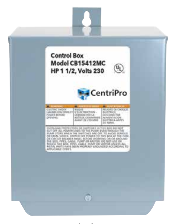
11/2 - 3 HP

For 3-wire, 1½ - 5 HP Submersible Motors