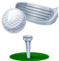
Blue Thunder Golf Play Day

Again, the boosters, along with the coaches and athletes, thank you for your support!!