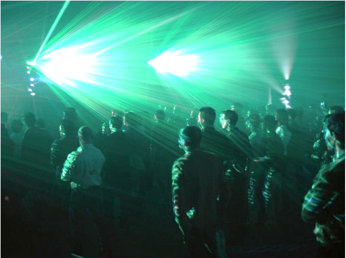
Photo of comfortable audience scanning. Note the soft laser beams and that spectators are not averting their vision. Photo taken in the mid-1990s at a trade fair in Rimini, Italy.