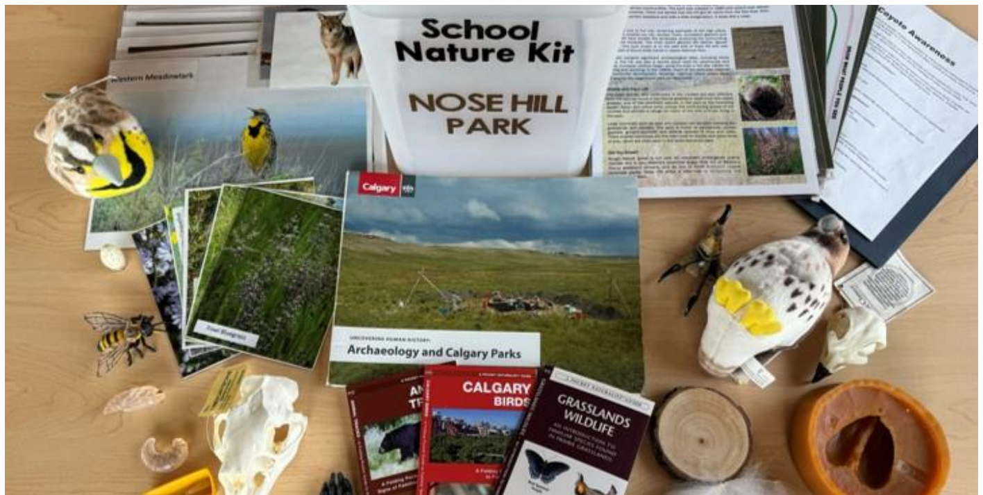
Contents of Nose Hill Park Nature Kit