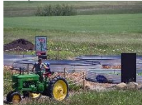
Cropland Grow Row