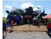
Orchard Tree House