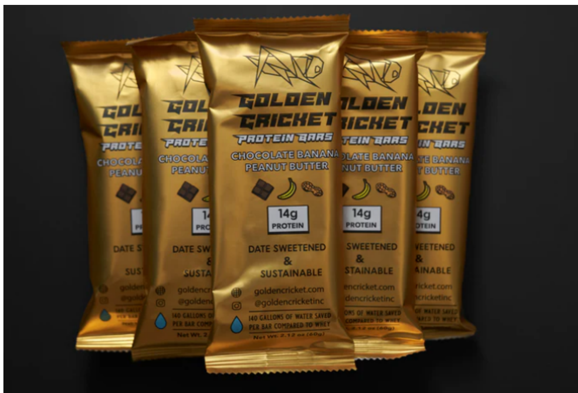
Golden Cricket Protein Bars

because it actually causes less indirect death compared to agriculture, due to the lack of pesticides killing trillions of both insects and rodents. Additionally, crickets are all natural and can't possibly be contaminated with pesticides, as it would kill them.