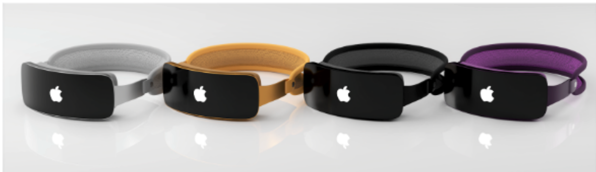
Figure 1: Ahmed C., winner of the Freelancer What will the Apple VR-AR Headset look like? contest

Apart from design projects specific to branding and new business ventures, the number of 3D Design, Product Design and general Design collectively grew over Q1 2023.