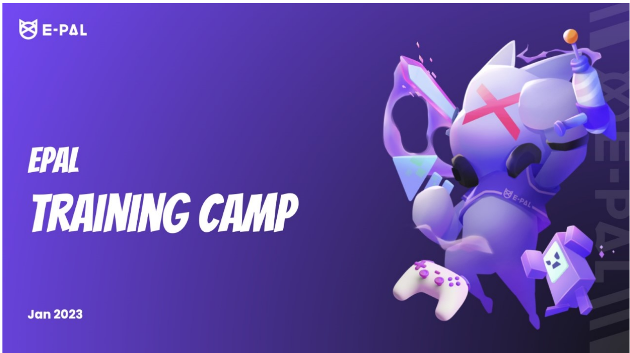
ePal Training Camp