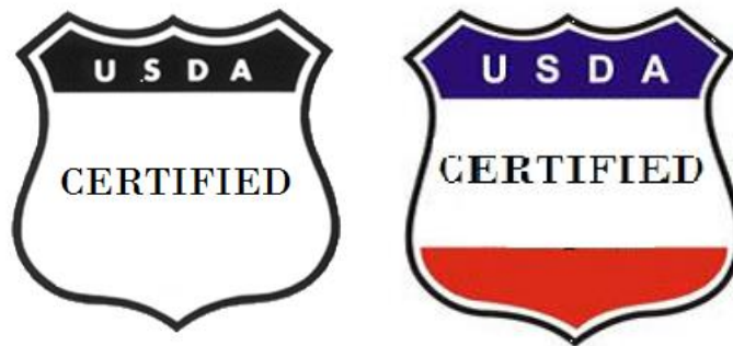
Figure 11 to paragraph (j). USDA Certified Mark.

(2) Use of the “USDA Certified” statement and the “USDA Certified” shield shall be approved in writing by the Director prior to use by an applicant.