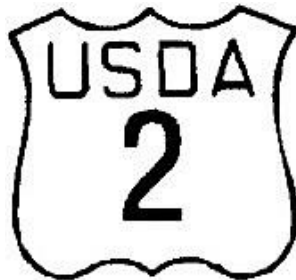
Figure 7 to paragraph (g). Official Grade Designation for Pork Carcasses

(g) The letters “USDA” with the appropriate grade designation “1,” “2,” “3,” “4,” “Utility,” enclosed in a shield as shown in Figure 7 to paragraph (g), as provided in the Official United States Standards for Grades of Pork Carcasses, constitutes a form of official identification under the regulations to show the grade under said standards of barrow, gilt, and sow pork carcasses.