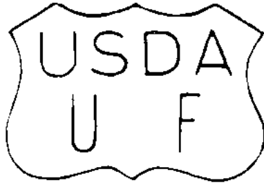
Figure 1 to Paragraph (a). Preliminary Grademark.

(b) A shield enclosing the letters “USDA” as shown in Figure 2 to paragraph (b) with the appropriate quality grade designation “Prime,” “Choice,” “Select,” “Good,” “Standard,” “Commercial,” “Utility,” “Cutter,” “Canner,” or “Cull,” as provided in the United States Standards for Grades of Carcass Beef, the United States Standards for Grades of Veal and Calf Carcasses, and the United States Standards for Grades of Lamb, Yearling Mutton, and Mutton Carcasses; and accompanied by the class designation “Bullock,” “Veal,” “Calf,” “Lamb,” “Yearling Mutton,” or “Mutton,” constitutes a form of official identification under the regulations to show the quality grade, and where necessary, the class, under said standards, of steer, heifer, and cow beef, veal, calf, lamb, yearling mutton, and mutton. The identification letters assigned to the grader performing the service will appear underneath and outside of the shield.