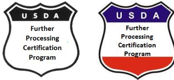
Figure 12 to paragraph (k). USDA Further Processing Certification Program Mark.

(l)(1) One device used by official graders is the LP-36 Form, a rectangular, serially numbered, red tag on which a shield encloses the words “USDA Hold,” constitutes a form of official identification under the regulations for meat and meat products.