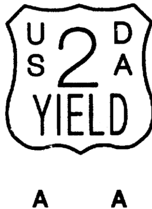
Figure 5 to paragraph (e). Official Yield Grade Identification Mark.

(e) Under the regulations, for yield grade identification purposes only, a shield enclosing the letters “US” on one side and “DA” on the other, and with the appropriate yield grade designation number “1,” “2,” “3,” “4,” or “5” as shown in Figure 5 to paragraph (e) constitutes a form of official identification under the regulations to show the yield grade under said standards. The identification letters assigned to the grader performing the service will appear underneath and outside of the shield.