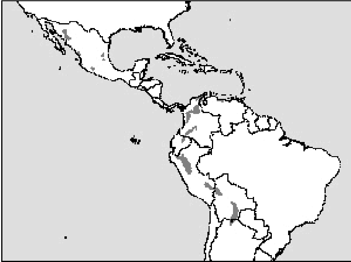
Figure 1. Distribution of Ara militaris. Courtesy of BirdLife International (2011).

The species inhabits tropical, semi-deciduous forests along the Pacific and Atlantic slopes through Central and South America. The best available information indicates there are reasonably healthy but small populations in El Cielo and Sierra Gorda Biosphere Reserves (Sierra meaning mountain range) in Mexico, Madidi and Amboró National Parks, Pilon Lajas Biosphere Reserve and Apolobamba National Integrated Management Area in Bolivia, and Manu Biosphere Reserve and Bahuaja Sonene National Park in Peru, and a small but stable remnant population in Tehuacan-Cuicatlan Biosphere Reserve, Oaxaca, Mexico (Lowry 2014, p. 3; Hosner et al. 2009, p. 222; Arizmendi 2008, p. 3; Rivera-Ortiz 2008, p. 256). The population