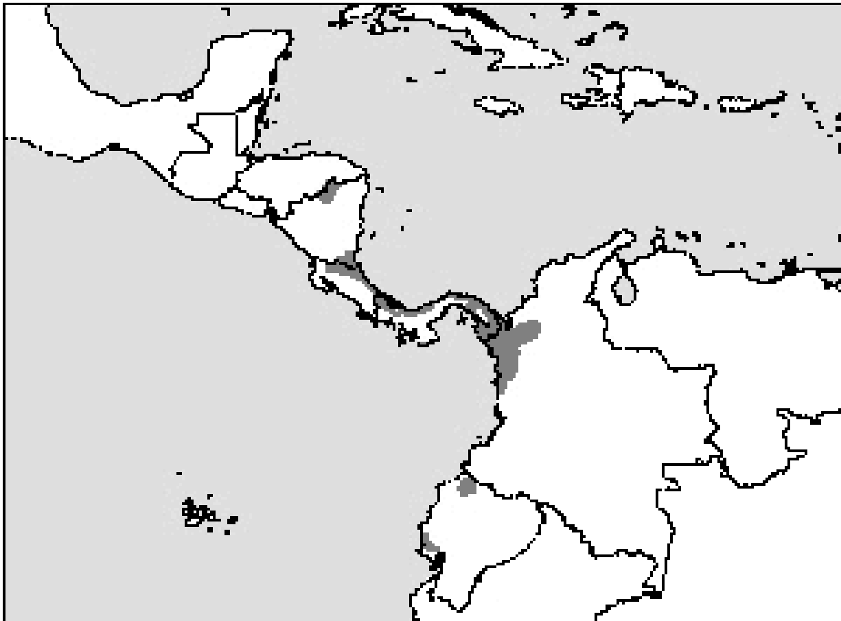
Figure 3. Distribution of Ara ambigua. BirdLife International 2011.

estimates of this species may not be accurate. Although the population in Costa Rica is increasing, the population continues to be very small (Monge et al. 2010, p. 16), and researchers believe that the global population of this species is decreasing (Botero-Delgadillo and Páez 2011, p. 91). Specific information about the range and population estimate for each country is discussed below.