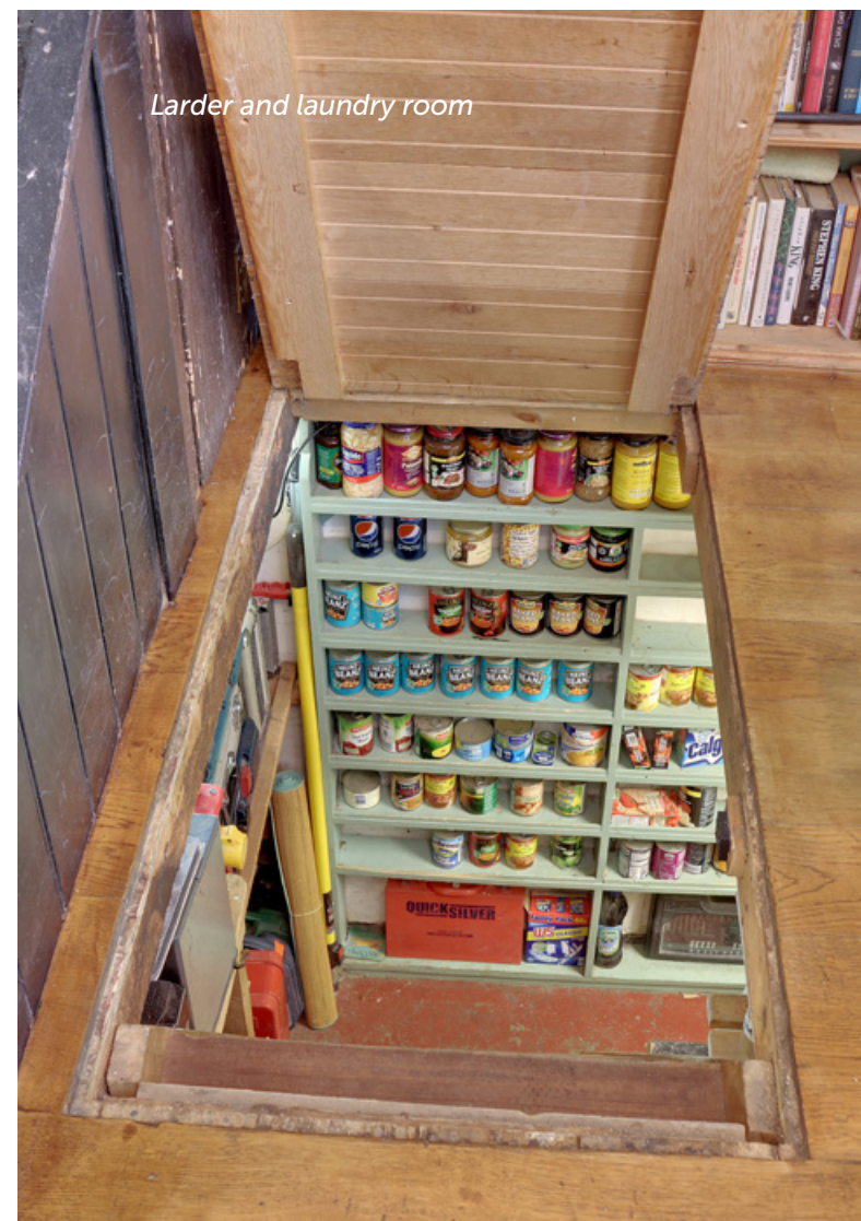
Larder and laundry room

At every turn you find something to catch your eye and please your heart. This is a home that brings out the interior designer in everyone, it brings out the best in your collection of keepsakes and inspires you to seek out new treasures. Each of the houses we have seen in this terrace have a very individual feel, each unique and every owner adds a little something of themselves to the rich story.