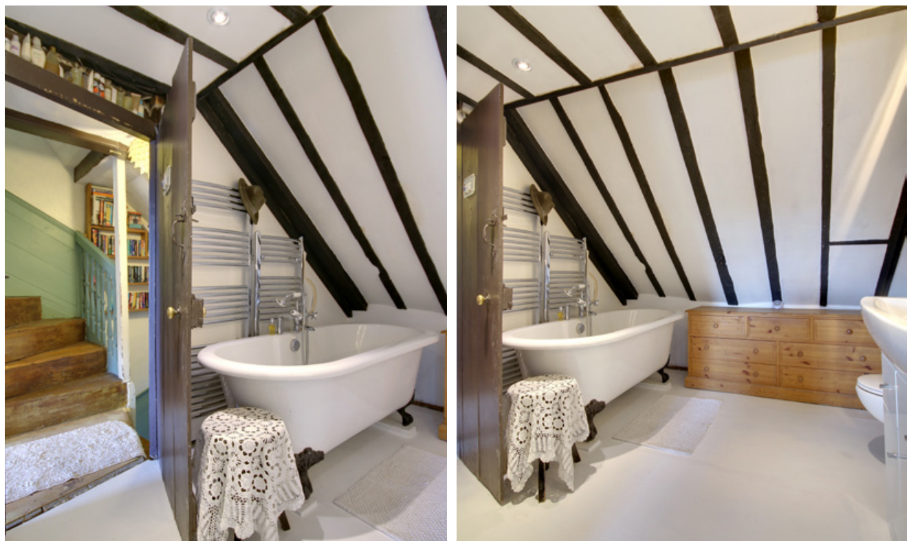
A fabulous feel to this bathroom, just one of the super discoveries as you wander through four floors of accommodation and history

At every turn you find something to catch your eye and please your heart. This is a home that brings out the interior designer in everyone, it brings out the best in your collection of keepsakes and inspires you to seek out new treasures. Each of the houses we have seen in this terrace have a very individual feel, each unique and every owner adds a little something of themselves to the rich story.