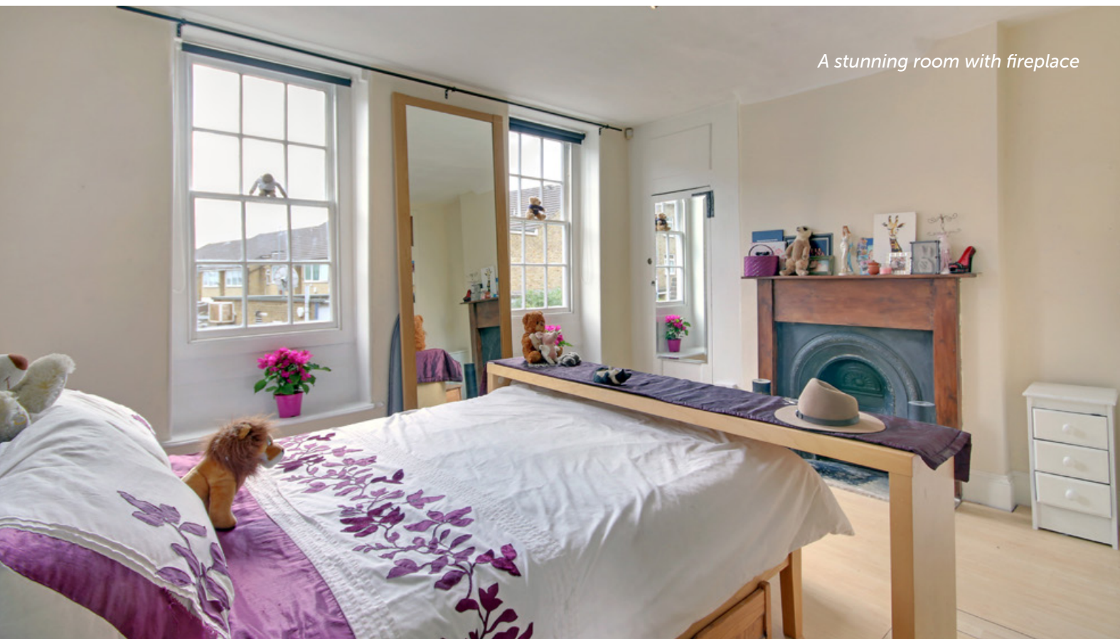
A stunning room with fireplace