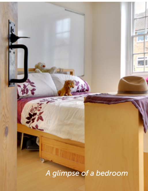
A glimpse of a bedroom