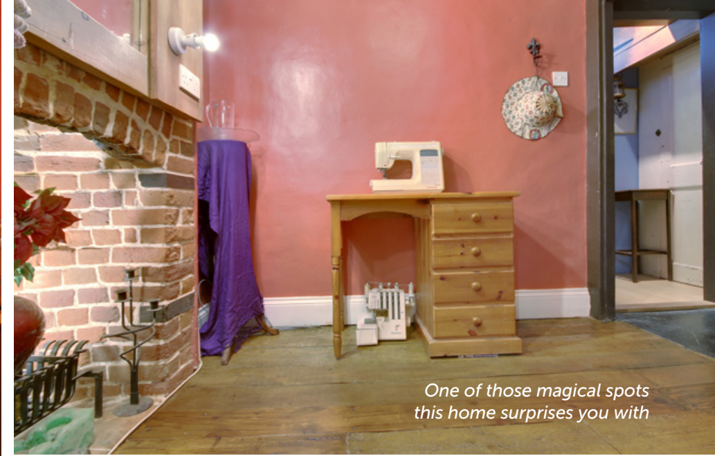
One of those magical spots this home surprises you with