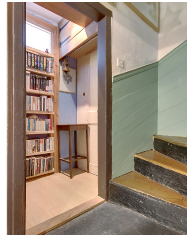
Unusual spaces make life here intriguing

For those of you who might want to make the kitchen even bigger, you'll be interested to know that one of the other homes received planning permission to extend. With a garden of approximately eighty feet to the rear, extending across the back will have little impact on your enjoyment of the outside space. Here the garden has been beautifully laid out to provide a great place to enjoy time with friends and family whilst sensible screening keeps your own parked cars out of sight. An access lane to the rear makes bringing things home so easy. Lilacs, other shrubs and a stocked border make this garden a delightful green space.