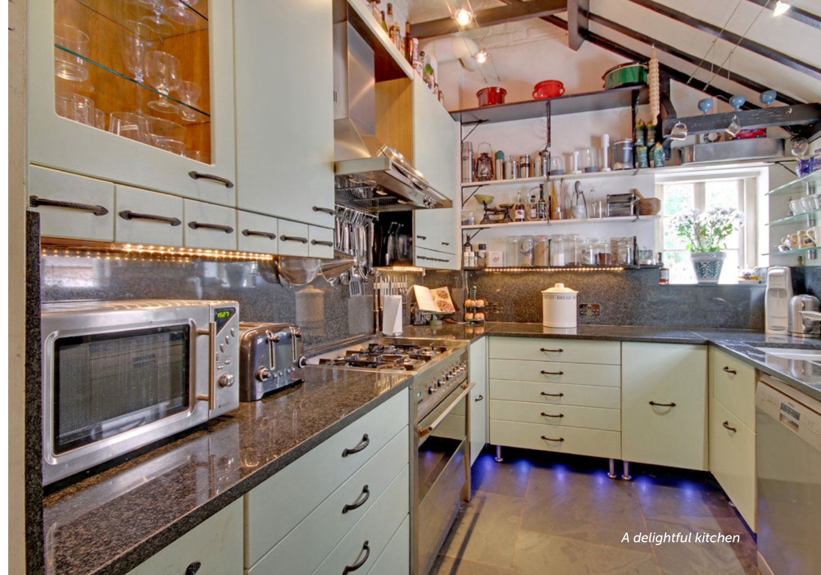
A delightful kitchen