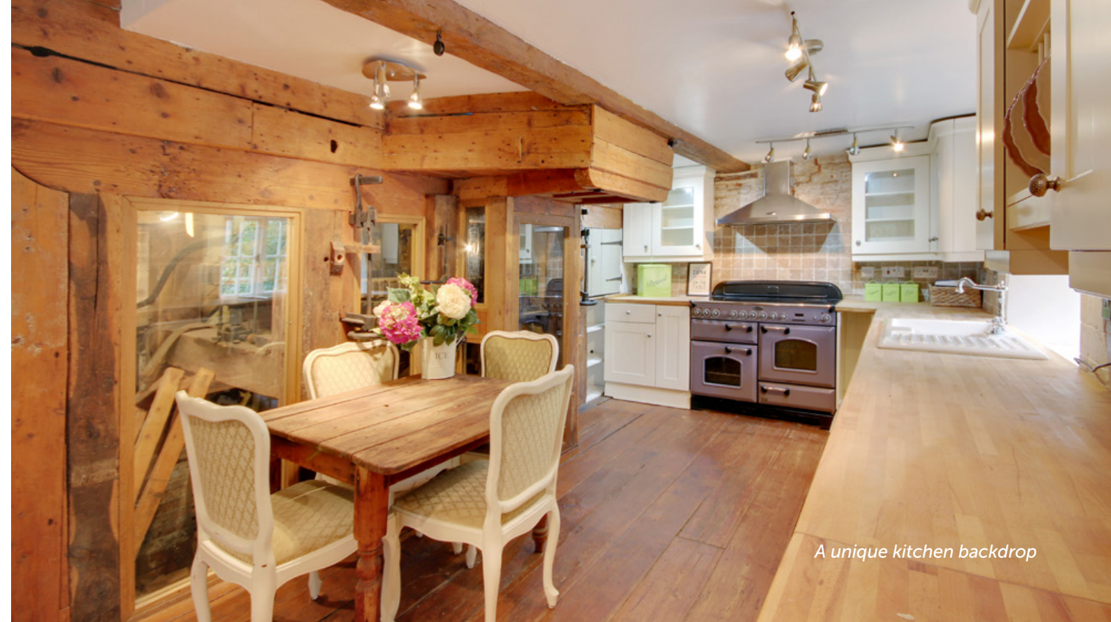
A unique kitchen backdrop