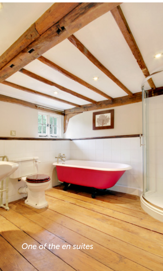
One of the en suites