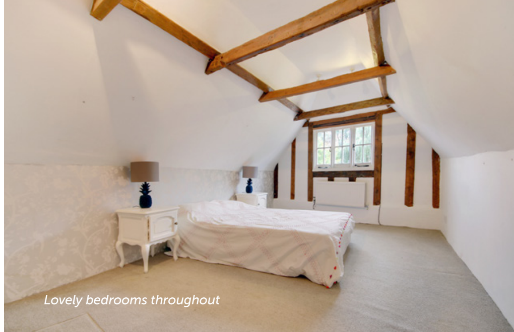
Lovely bedrooms throughout