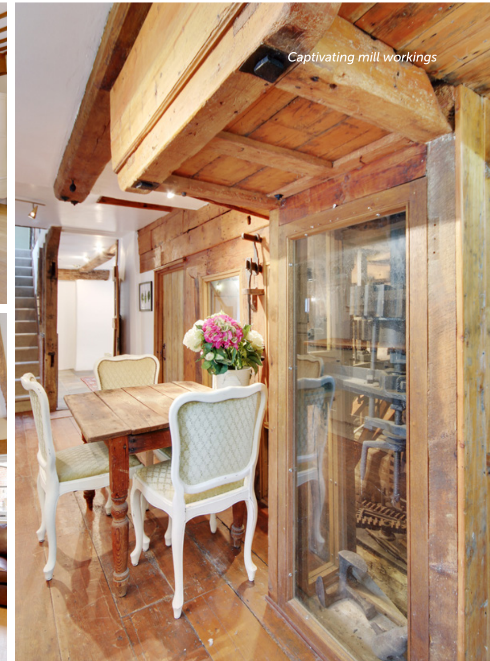
Captivating mill workings