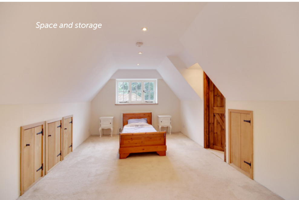
Space and storage