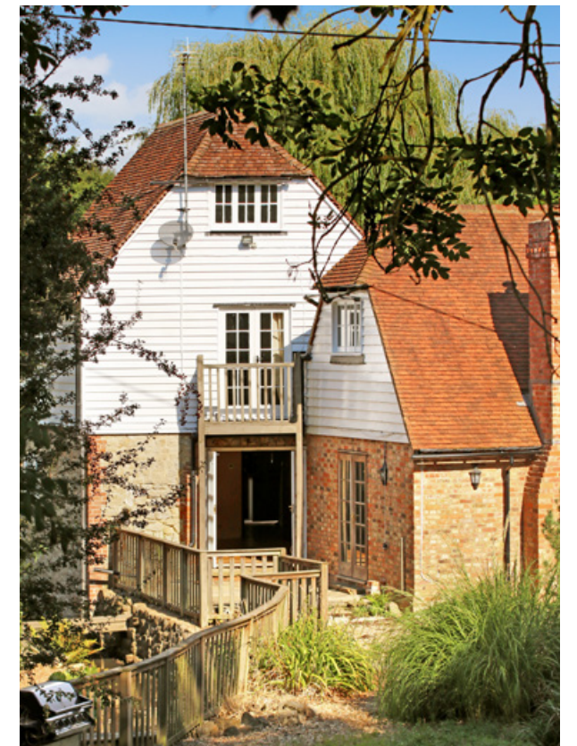
Charming from every angle

Sitting Room Dining Room Family Room Breakfast Room Cloakroom 4/5 Bedrooms 'TV Room' 2 Ensuites Bathroom Garage 'Training Room' Approx 3 Acres Grade II Listed