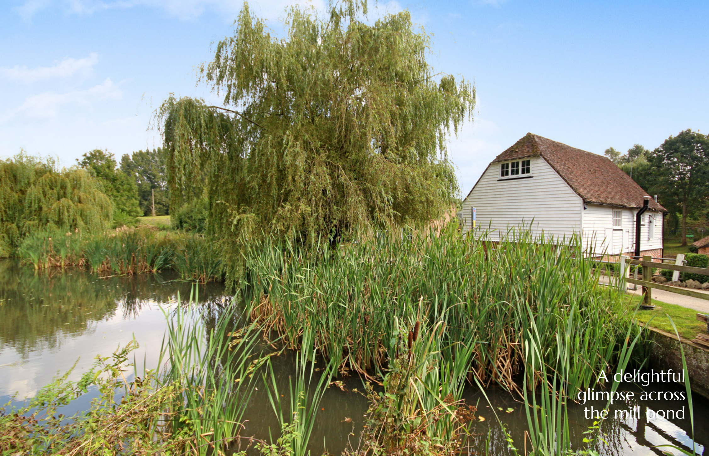
A delightful glimpse across the mill pond