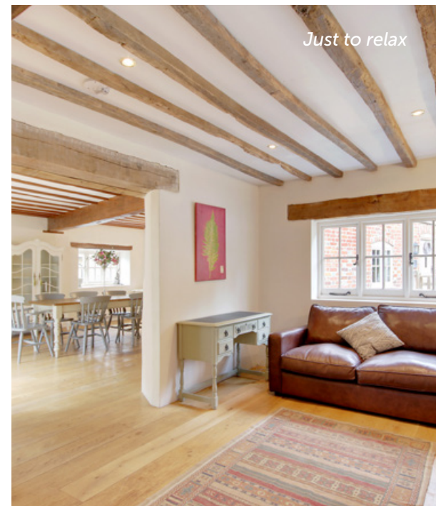
Just to relax

Millstones, cogs and a corn crusher, perhaps one of the first eight in the country from a company in Budapest. It's a fascinating subject to explore as a home owner.