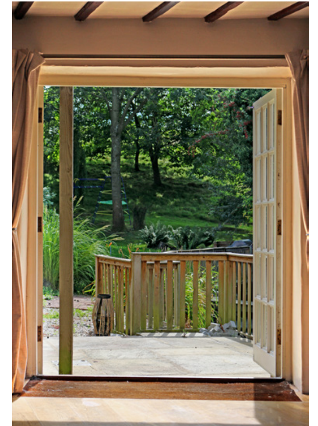
Stepping out into the garden and a feel of adventure