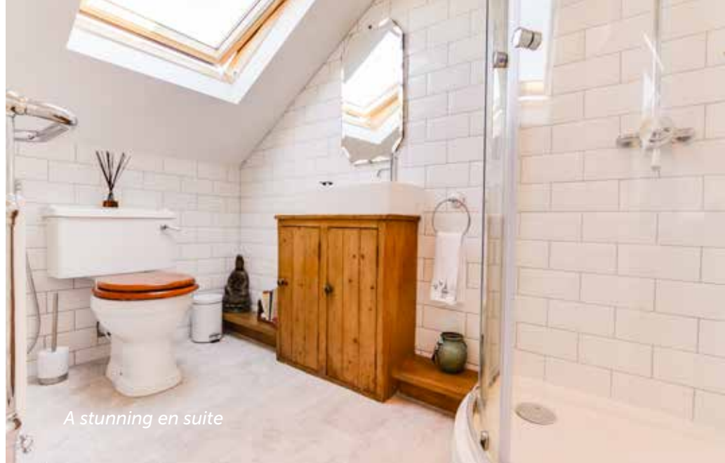
A stunning en suite