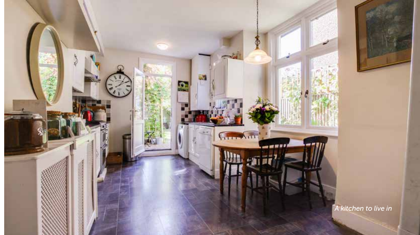
A kitchen to live in