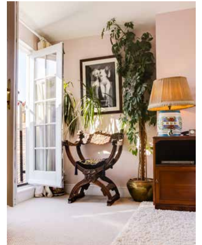
A stunning bedroom

For some the bay window will capture your imagination or perhaps the sight of the kitchen stretching away with a glimpse of the lovely rear garden luring you toward it. For us one of the biggest and best