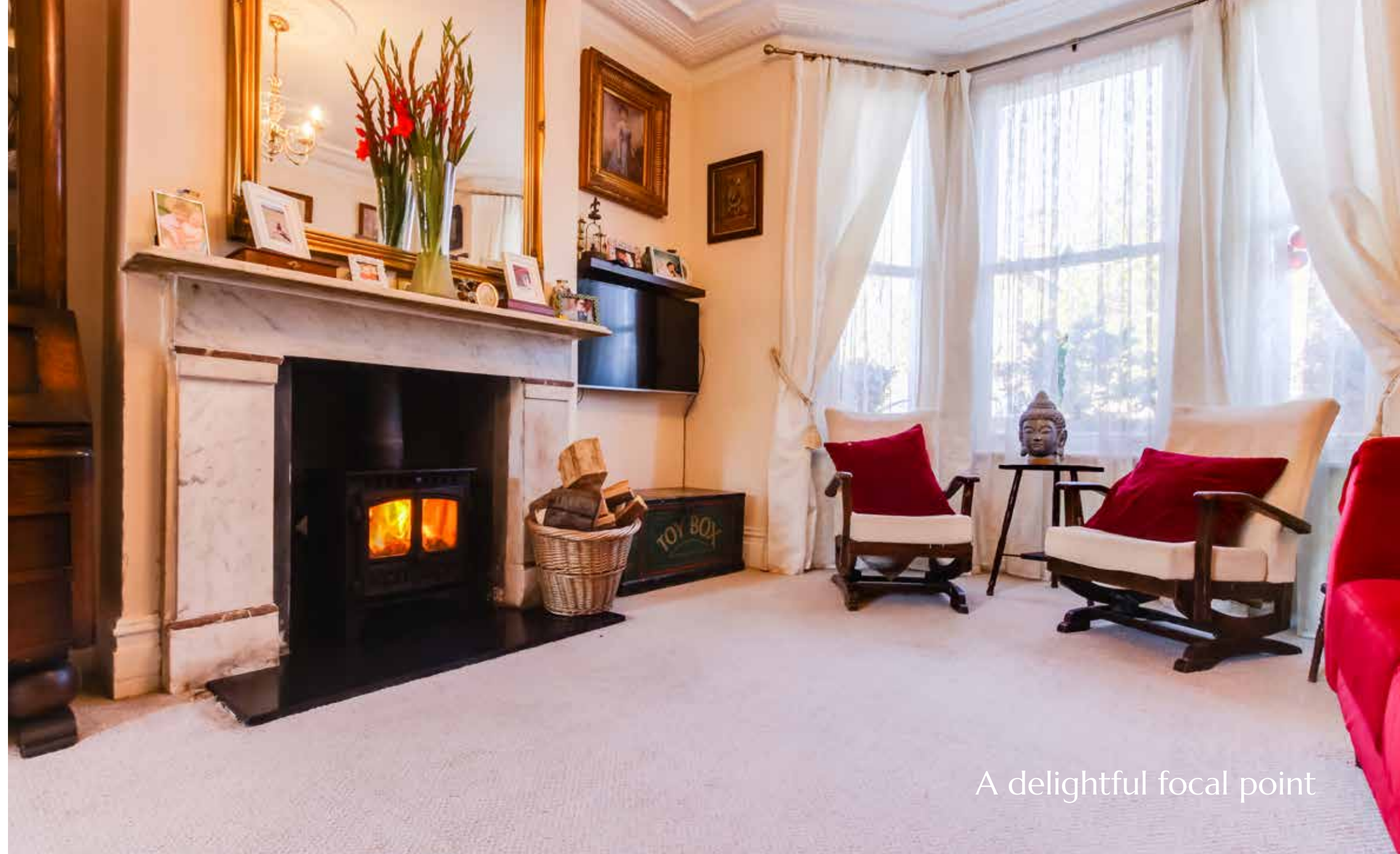
A delightful focal point