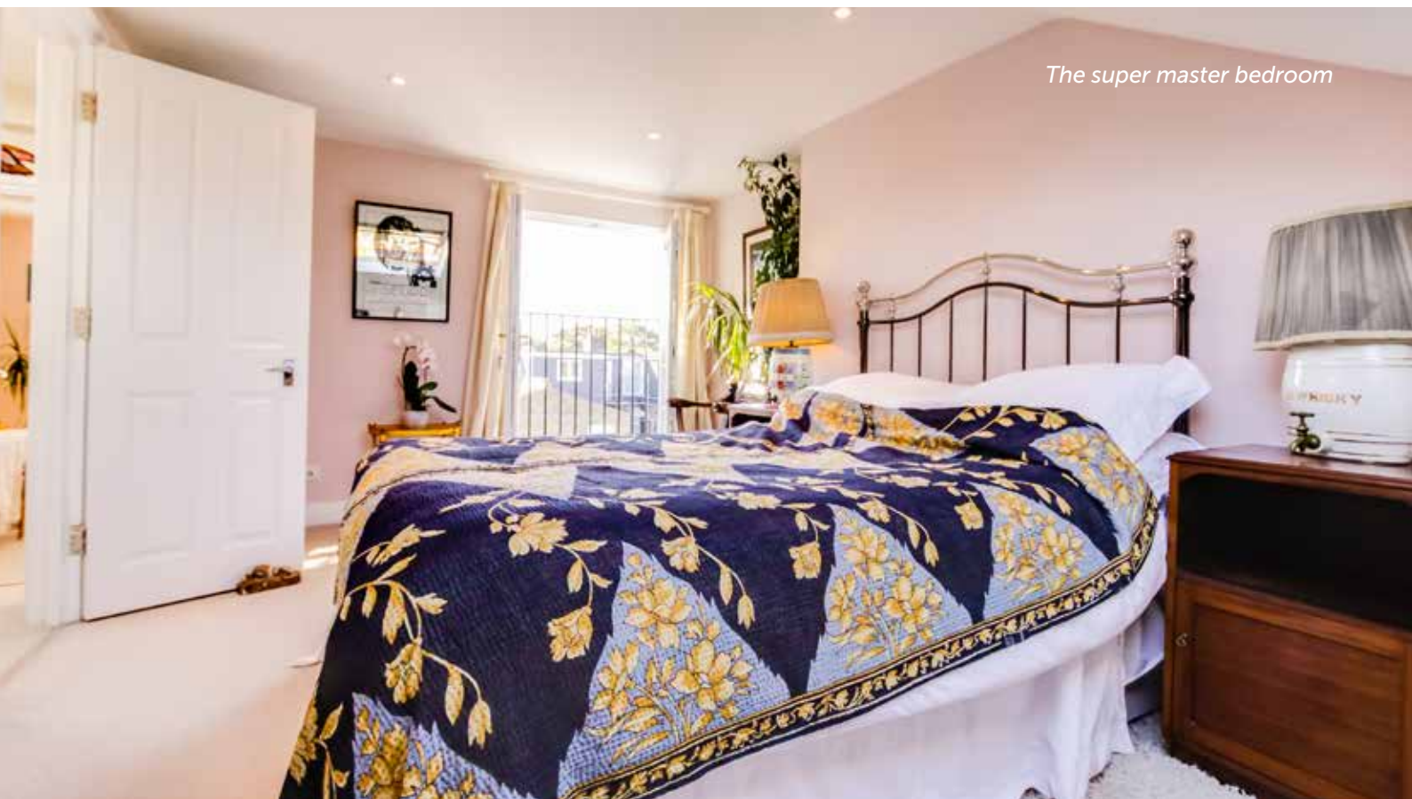
The super master bedroom