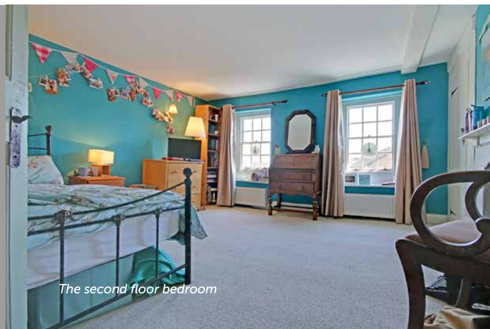
The second floor bedroom