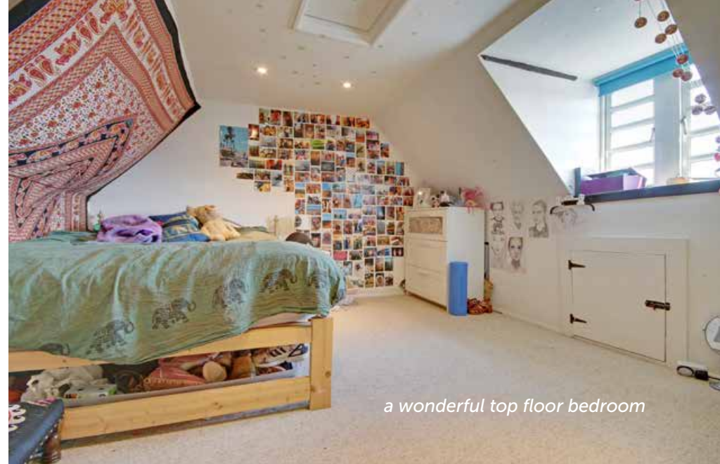
a wonderful top floor bedroom