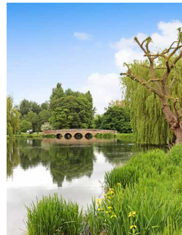
Foots Cray Meadow, 240 acres to explore

Outside there is a rear garden that was awash with colour when we did our photo shoot, from a stunning camellia that obviously loves being here.