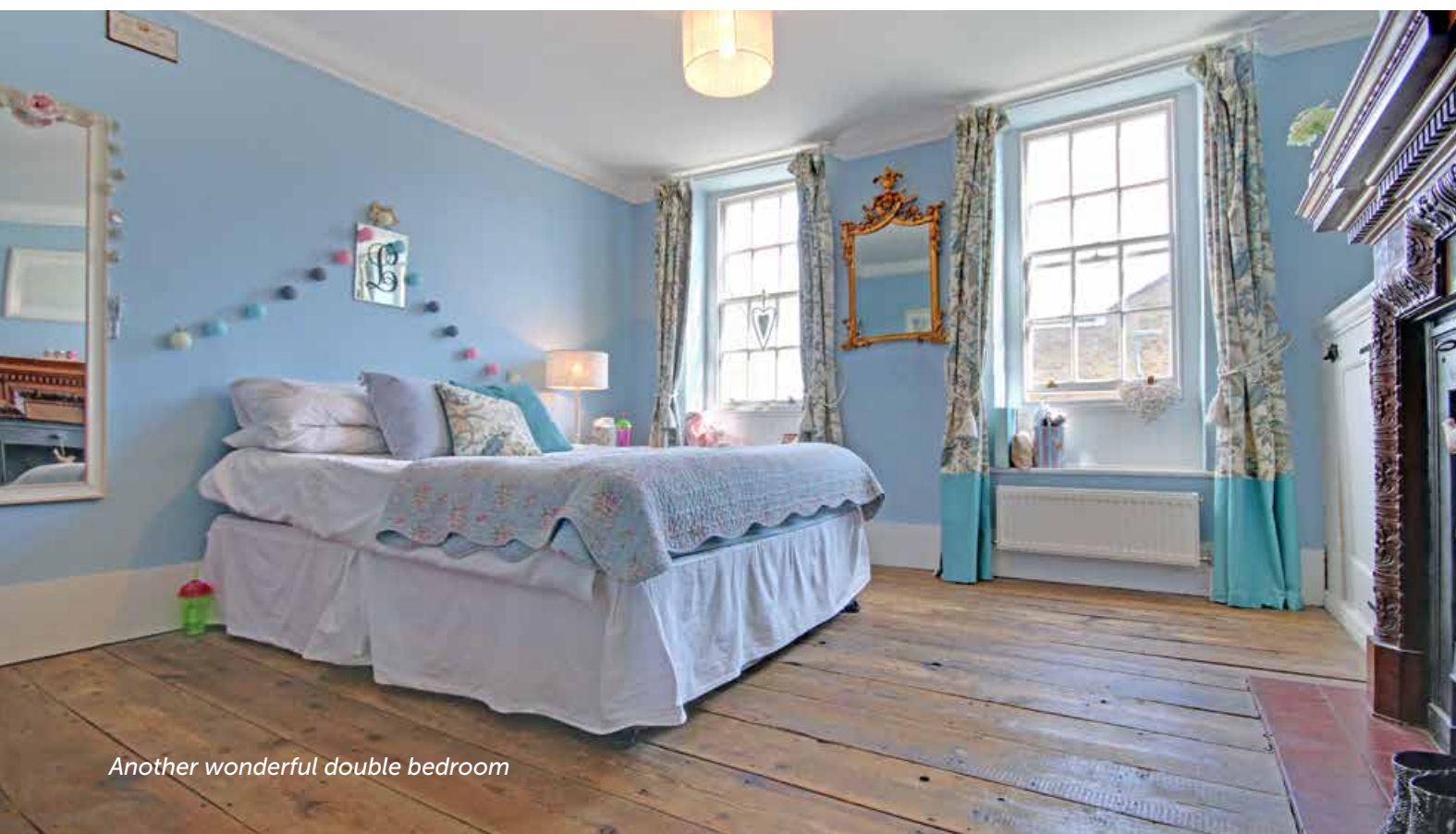
Another wonderful double bedroom