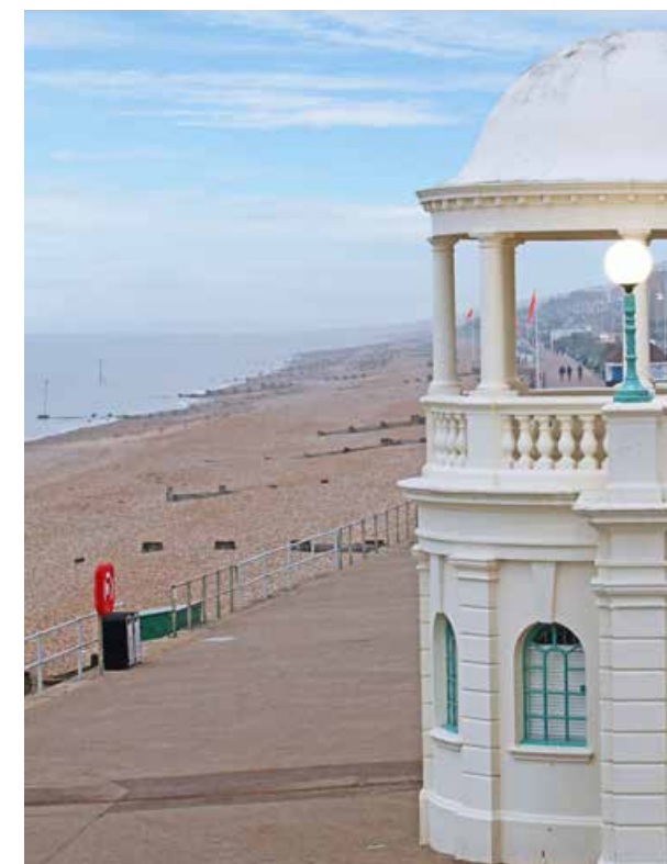
Stroll the promenade nearby

Step out of the buildings front door, turn left and within moments you are walking onto a wonderful promenade that stretches along the coastline. We stood and watched dinghies from the sailing club racing on the sea. Carry on past the rowing club to the Grade I Listed De La Warr Pavilion, established in 1935 and 'Modern ever since'. Enjoy the art there or plan to capture a show, it's just part of the huge spectrum of things you can fill your spare time with when you live here.