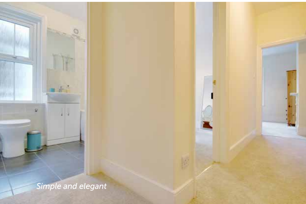
Simple and elegant