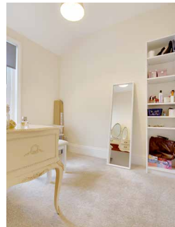
Third bedroom, dressing room or study, the choice is yours