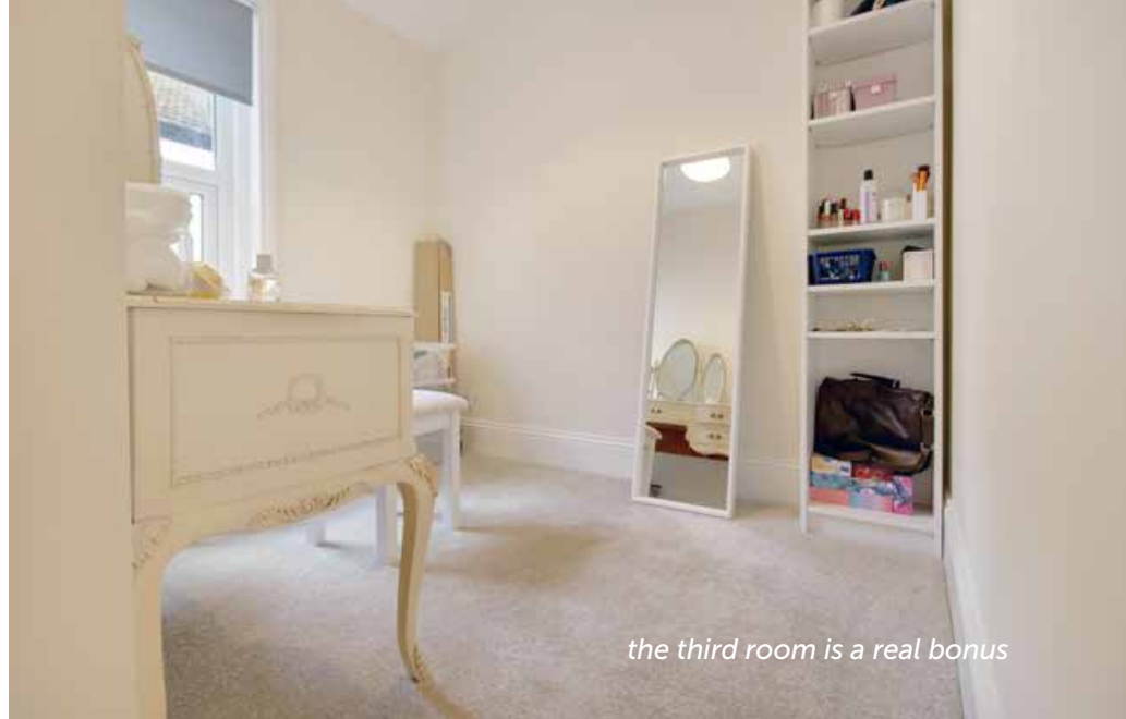
the third room is a real bonus