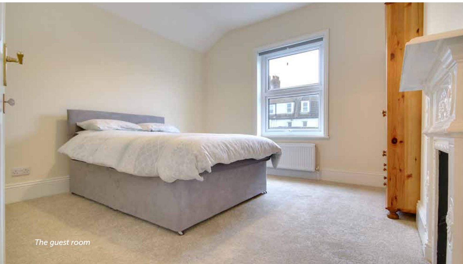
The guest room