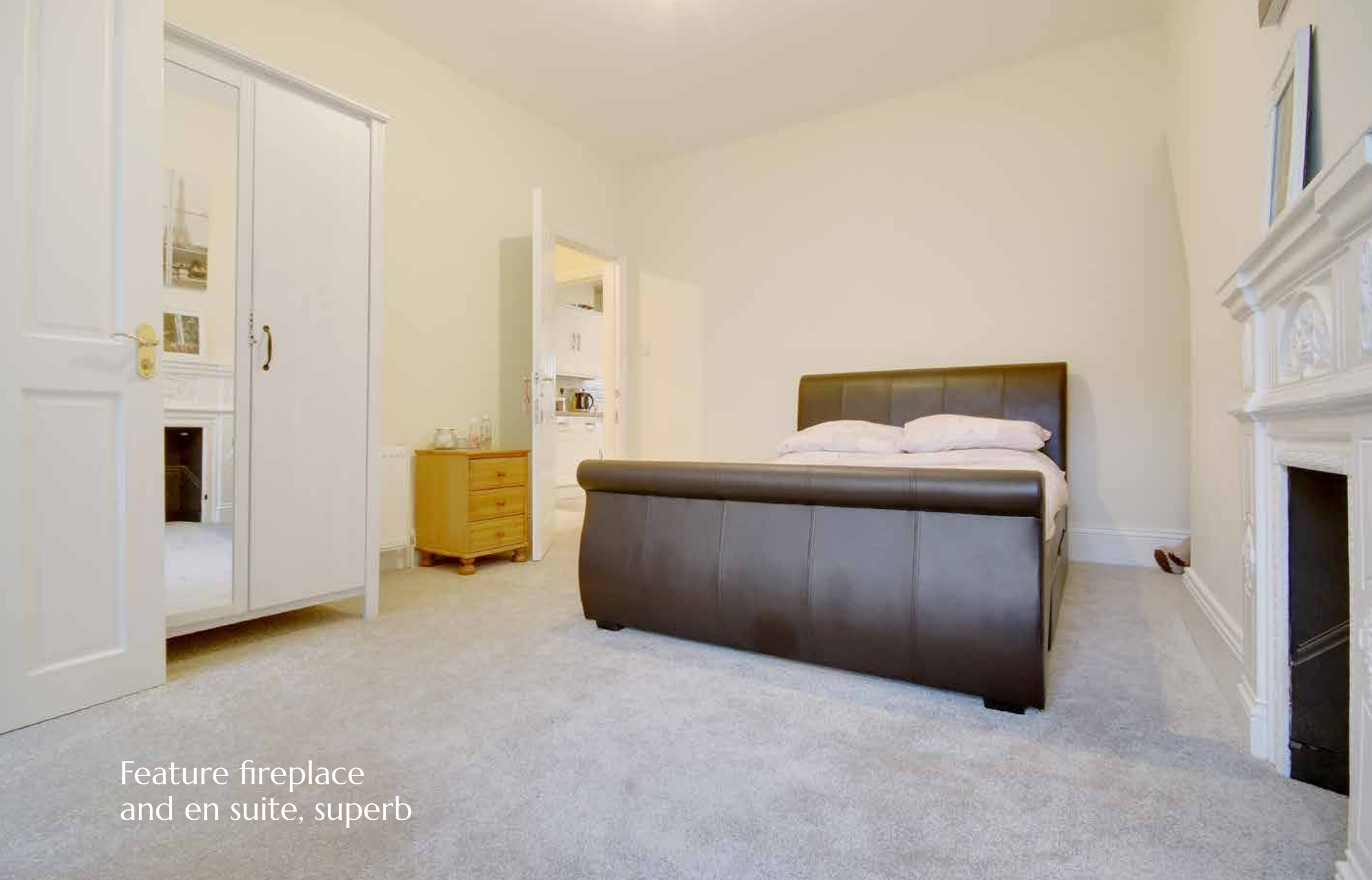
Feature fireplace and en suite, superb