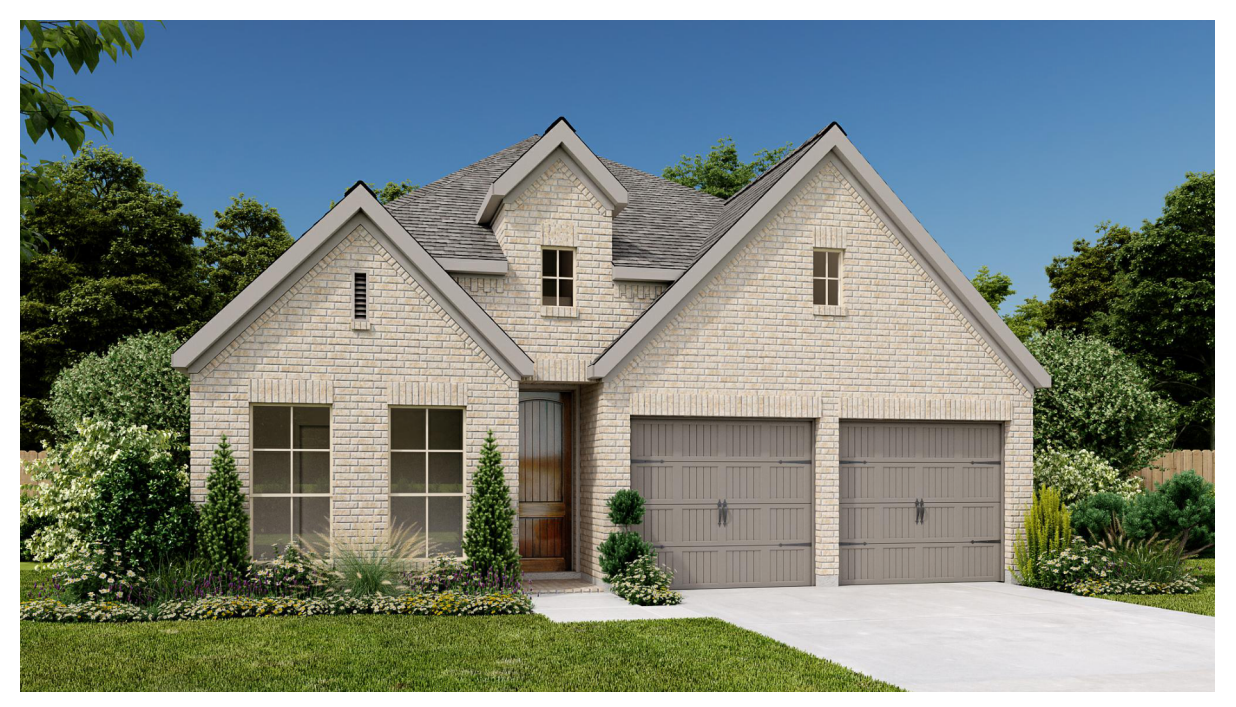
DESIGN 2169W E-1