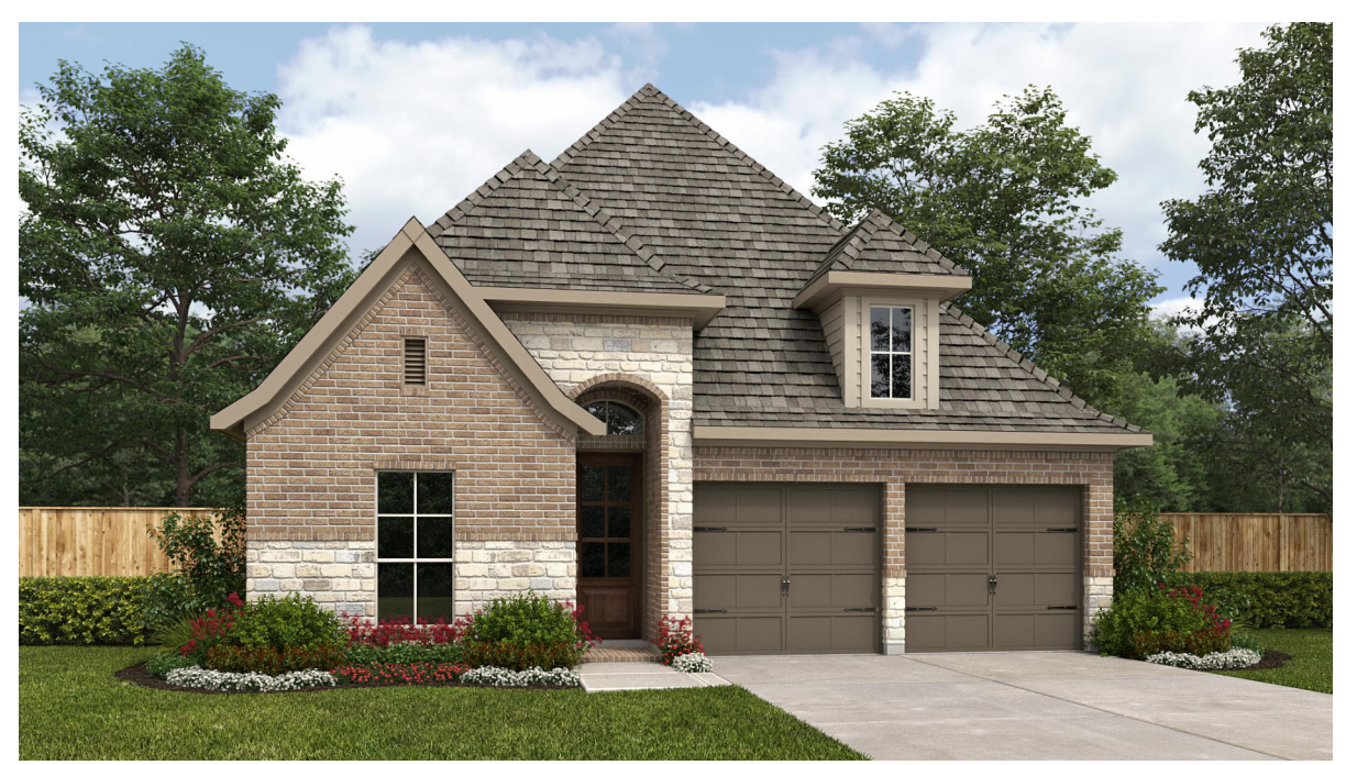
DESIGN 2169W E-50