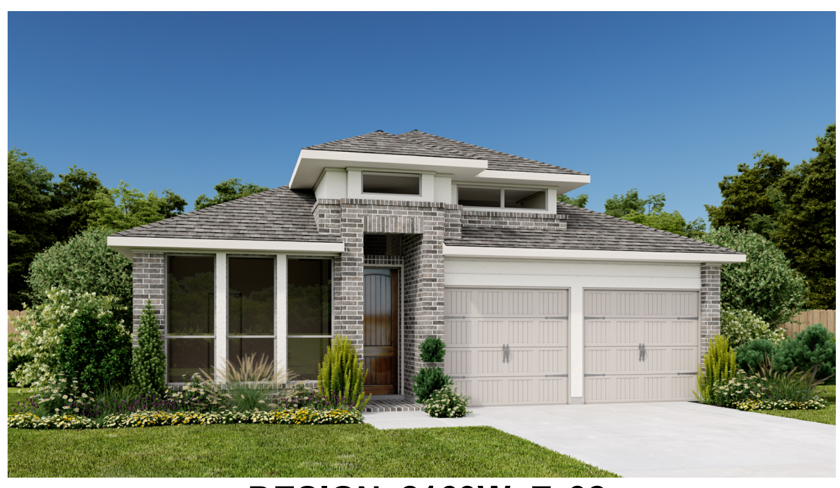
DESIGN 2169W E-32