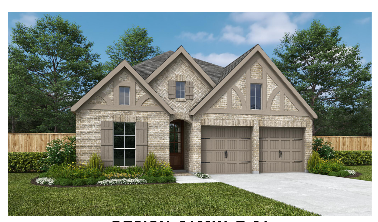
DESIGN 2169W E-31