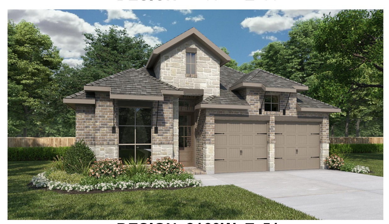
DESIGN 2169W E-51

This design, as originally designed and prior to any changes you make, is estimated to yield approximately the number of square feet shown on page 1. All dimensions are approximate. Square footage may vary based on as-built dimensions, configurations, plan options and/or the method of calculation. Designs are not-to-scale, and are conceptual illustrations that may differ from construction plans or completed improvements. A design may depict features not available on all homesites or in all communities. Perry Homes reserves the right to make changes in plans and specifications, and to substitute material of similar quality. Prices, terms, promotions, plans, dimensions, features, options, amenities, elevations, designs, square footages, specifications, materials, and availability of homes or communities are subject to change without notice or obligation. All obligations will be governed by a written contract. This design does not constitute a commitment to build a particular floor plan or home in any given community Some floor plans, options, and/or elevations may not be available on certain homesites or in a particular community and may require additional charges. Please check with Perry Homes to verify current offerings in the communities you are considering. This rendering is the property of Perry Homes, LLC. Any reproduction or exhibition is strictly prohibited. Perry Homes, LLC 2021