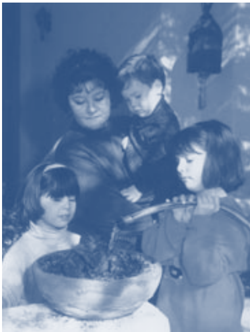
Water conservation will remain important as we plan for the future.

Tucson Water could expand the Clearwater Project to accept additional Colorado River water for recharge and recovery.