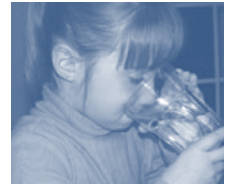
Tucson Water serves more than 680,000 customers throughout the Tucson region.