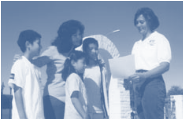
Tucson Water will be talking with its customers about the decisions that need to be made about our water future.

Tucson Water's Long-Range Water Plan was developed to address a wide range of potential future situations and determine a number of possible pathways that could lead to them. These different pathways each have a series of Decision points, where the community must determine which alternative pathway they want to follow. For each Decision, Tucson Water has developed a list of water programs and projects that will be implemented. These programs and projects have been selected to maintain as much flexibility as possible to meet currently unknown obstacles and take advantage of opportunities as they appear.