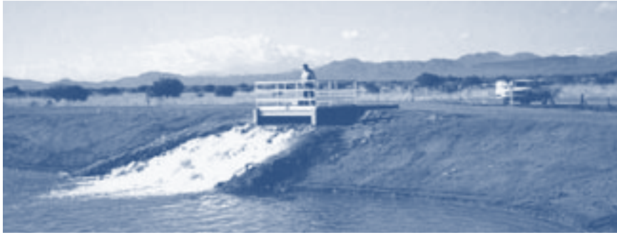
Nearly half of Tucson's Colorado River water is used at the Clearwater Facility in Avra Valley.