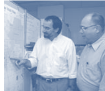
A number of water professionals, like these Tucson Water hydrologists, have been involved in the development of the Long Range Water Plan.

Because Tucson Water's Long Range Water Plan was created using scenario planning, decisions made and projects completed in the next few years will move the plan forward while still allowing us to make choices in the future about how to best use our effluent.