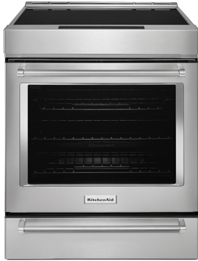
Stainless Steel KSIB900ESS