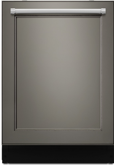
Panel Ready KDTM504EPA