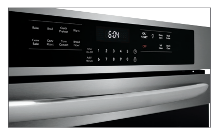
Quick Preheat Preheat in just a few minutes.1

Effortless™ Temperature Probe The Effortless ™ Temperature Probe detects and alerts when the desired finished cooking temperature has been reached and automatically switches to the keep warm settina.