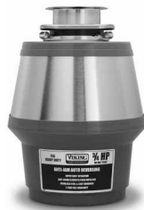
VCFW750 3/4 HP