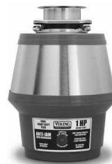
VCFW1000 1 HP