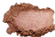
BEACH BABY Neutral Shimmer