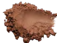
ISLAND TAN Neutral Matte