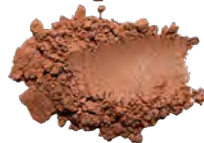
STAY TAN Cool Matte