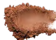
GOLDEN HONEY Neutral Sparkle