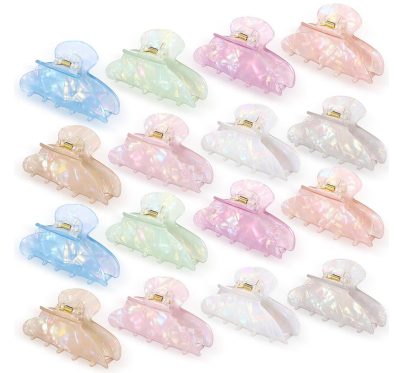
Hair clip $25 Per Person