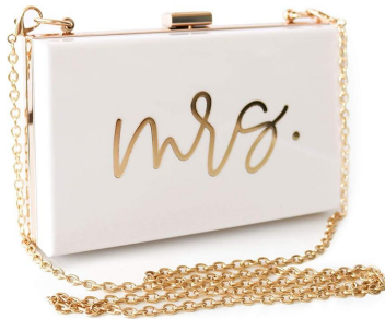
Mrs clutch $55 Per Person