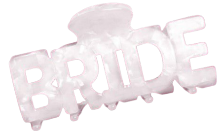
Bride Hairclip $35 Per Person