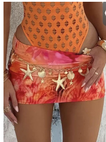
Belly Chain $65 Per Person