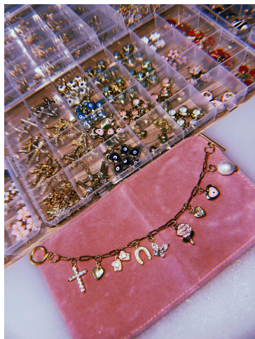
Bracelet $45 Per Person