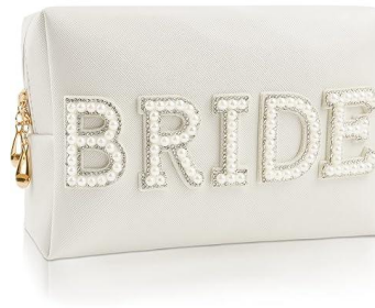
Bride Makeup Bag $45 Per Person