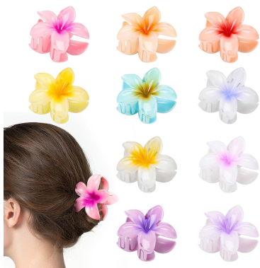
Flower Hair clip $35 Per Person