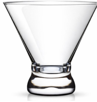
Stemless Martini Glass $35 Per Person