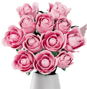
Forever Rose $35 Per Person