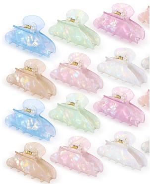
Hair clip $25 Per Person

Guests customize a signature item using a full gem bar featuring a variety of colors, sizes, and embellishments. Each guest is provided with all tools including a professional bedazzling pen, glue, and gem tray.