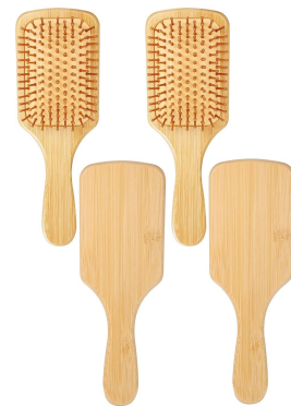
Wooden Hair Brush $55 Per Person