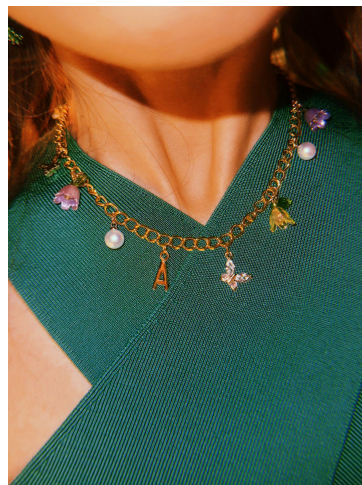
Necklace $55 Per Person