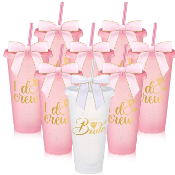
Tumbler $35 Per Person