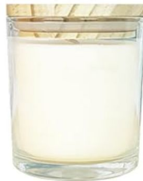
6oz Glass Candle $50 Per Person