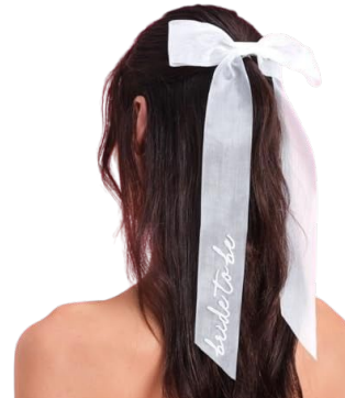
Bride to Be Bow $35 Per Person