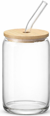
Iced Coffee Glass $35 Per Person