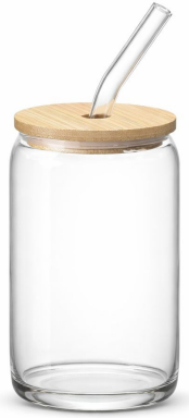
Iced Coffee Glass $35 Per Person