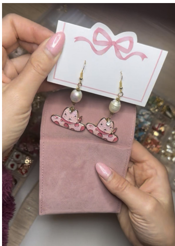
Earrings $25 Per Person

Guests design a custom charm necklace, bracelet, or body chain from a curated charm selection, creating a personalized keepsake. Each guest is provided with all tools including professional jewelry pliers, chain, and jump rings.