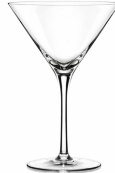
Martini Glass $45 Per Person