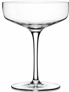
Curved Martini Glass $45 Per Person