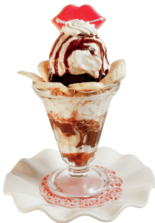
Choco Banana Parfait

Banana, chocolate sauce, mascarpone, granola, mochi brownie, Ice cream, Lip cookie