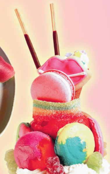
TOKIO Tower Parfait