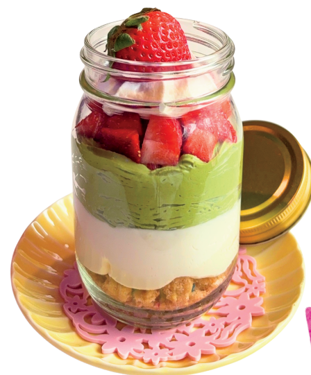
Matcha Cheese Cake

Matcha cheese cake, cheese cake, strawberry, birthday cake crumb