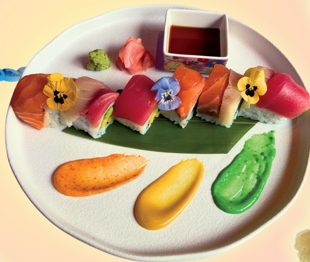
TOKIO DELIC Roll