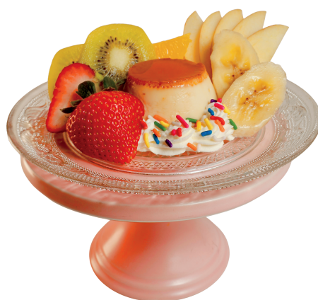
Pudding à la mode TOKIODELIC Style

Flan, seasonal fruit with whipped cream and sprinkles