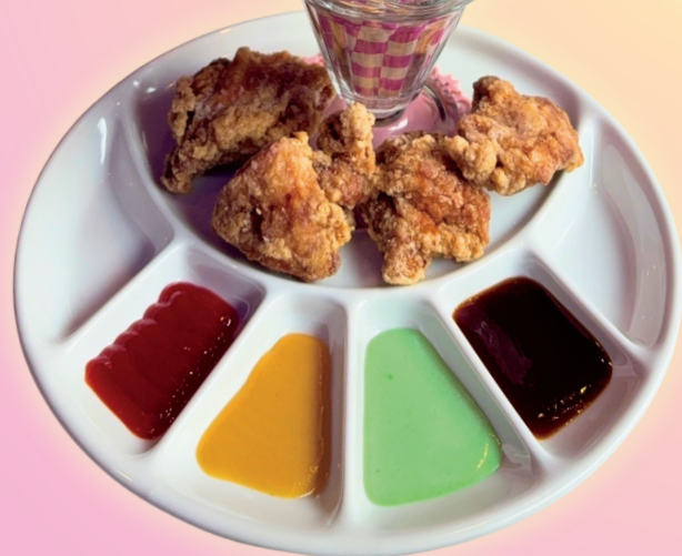
DELIC Fries & Karaage Combo