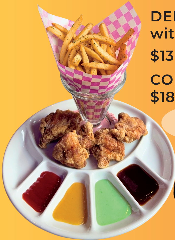
DELIC Fries with Chicken Karaage

Mix, dip, and create your own flavor masterpiece!