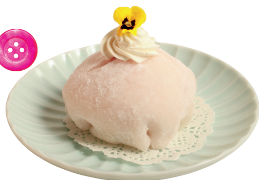
Strawberry Mochi Fruit Cake

Strawberry, sponge cake, whipped cream wrapped in mochi gyūhi