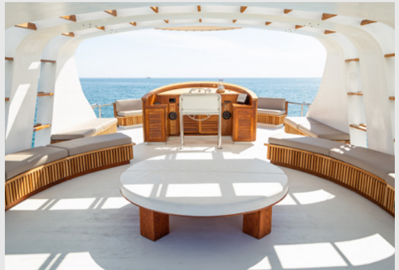
Second Deck Lounge