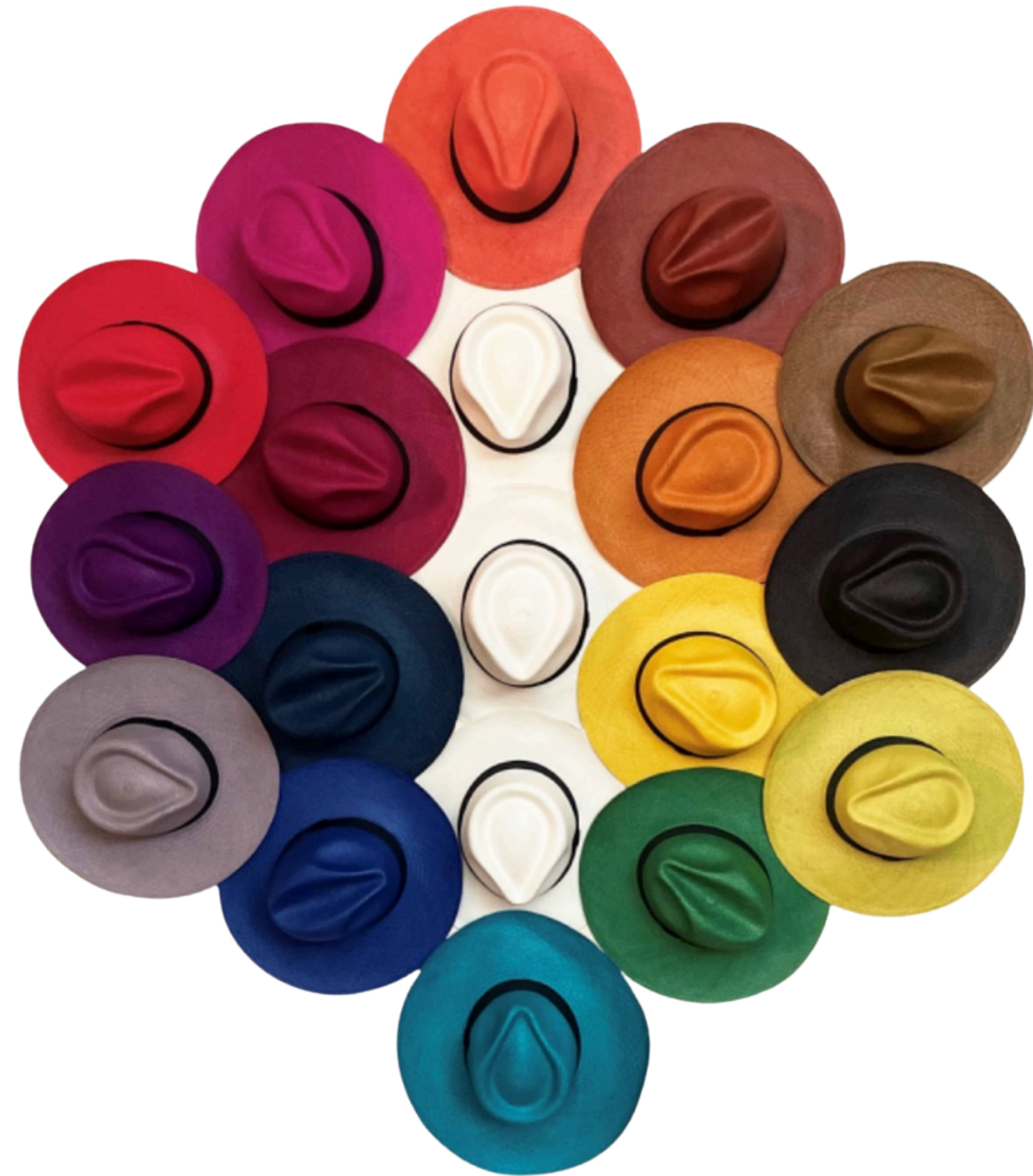
Vibrant Color Range