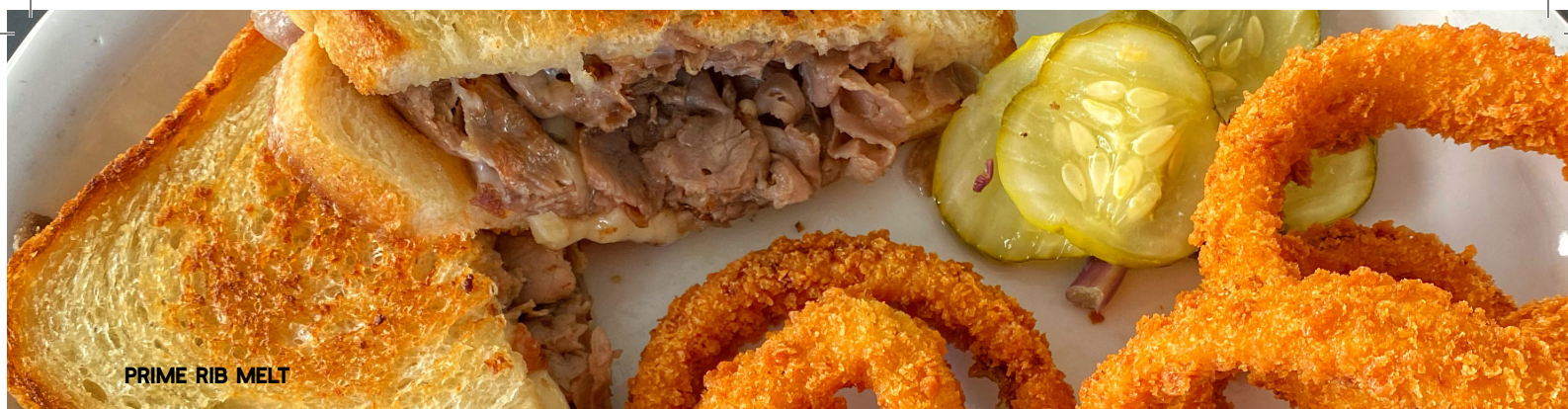
PRIME RIB MELT