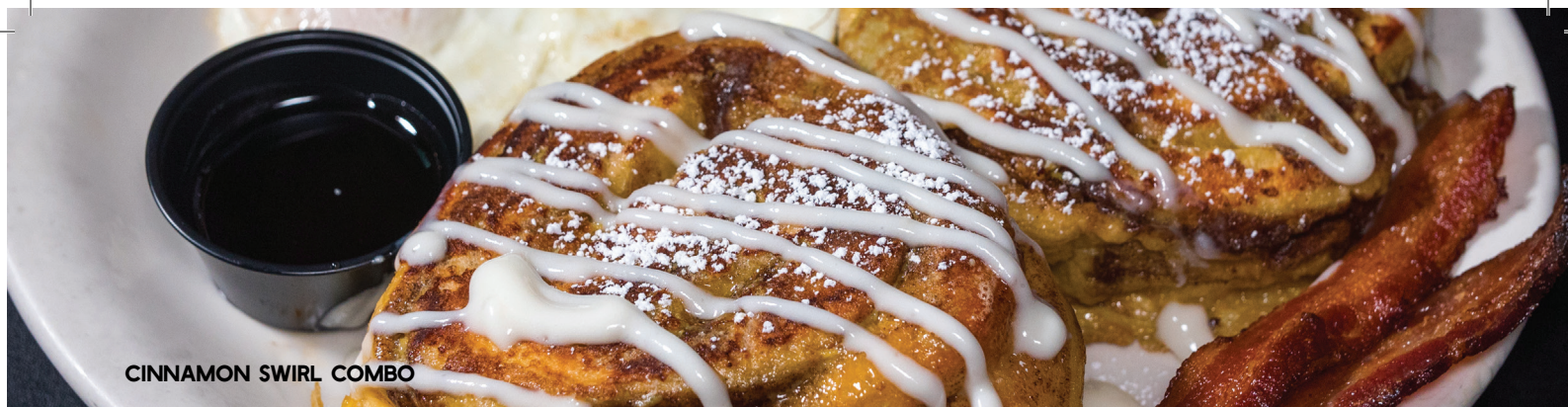
CINNAMON SWIRL COMBO