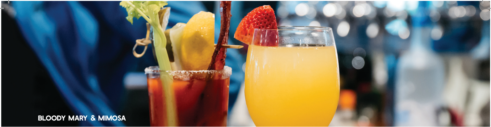
BLOODY MARY & MIMOSA