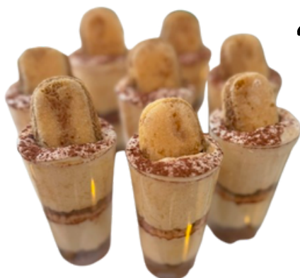
15+ Flavor Options!

ALL ITEMS ARE MADE WITH LOVE IN A KITCHEN THAT MAY CONTAIN TRACES OF: PEANUTS, TREE NUTS, MILK, EGGS, WHEAT, SOY, AND SHELLFISH