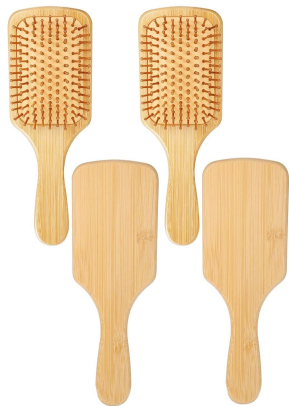
Wooden Hair Brush $35 Per Person