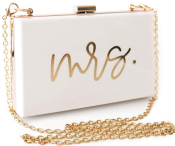
Mrs clutch $55 Per Person