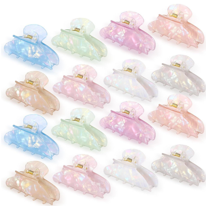
Hair clip $25 Per Person

Guests customize a signature item using a full gem bar featuring a variety of colors, sizes, and embellishments. Each guest is provided with all tools including a professional bedazzling pen, glue, and gem tray.