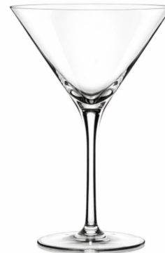
Martini Glass $45 Per Person