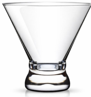
Stemless Martini Glass $35 Per Person