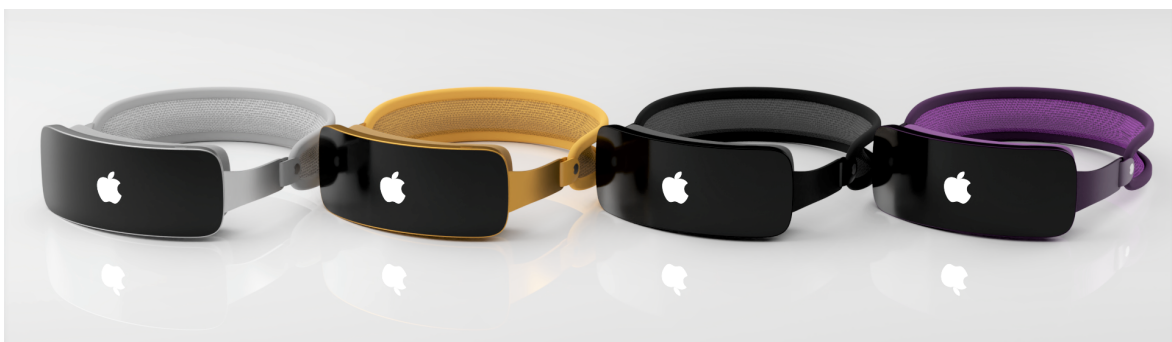
Figure 1: Ahmed C., winner of the Freelancer What will the Apple VR-AR Headset look like? contest

Apart from design projects specific to branding and new business ventures, the number of 3D Design, Product Design and general Design collectively grew over Q1 2023.