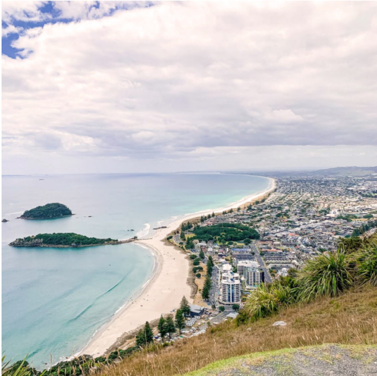
Mount Maunganui, New Zealand

Actual photos taken using Photo Anywhere: