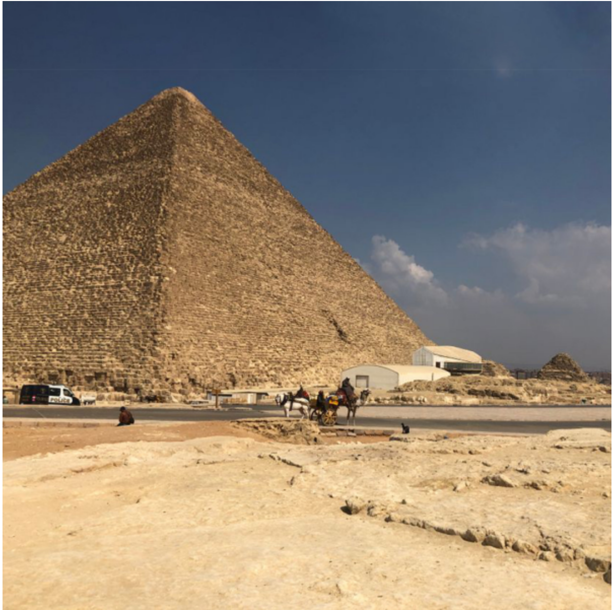
Giza Pyramid Complex, Al Haram, Egypt