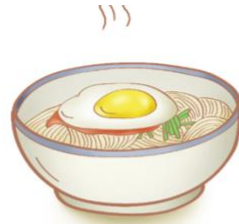
miàn tiáo 面条