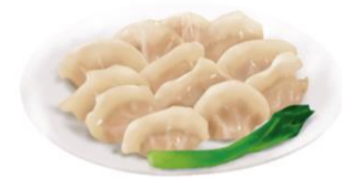
bāo zi 饺子