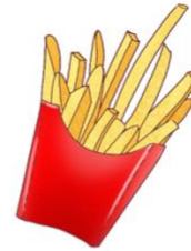
shǔ tiáo 薯条