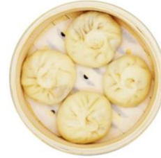
bāo zi 包子