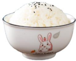
mǐ fàn 米饭