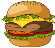
hàn bǎo 汉堡