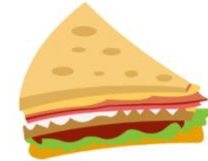
sān míng zhì 三明治