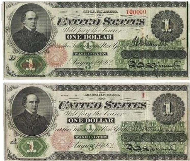
Figure 3. Someone put together this neat pair, not a rollover pair because the 100000 is series 73 and the 1 is series 20. The 100000 had to be hand set because the numbering heads had only 5 number wheels.