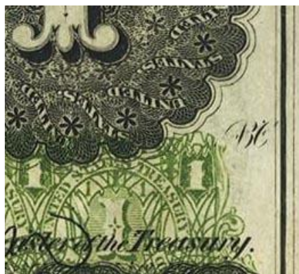
Figure 5. Bank note company monograms: ABC on Fr.17a (left) and N on Fr.95b (right).