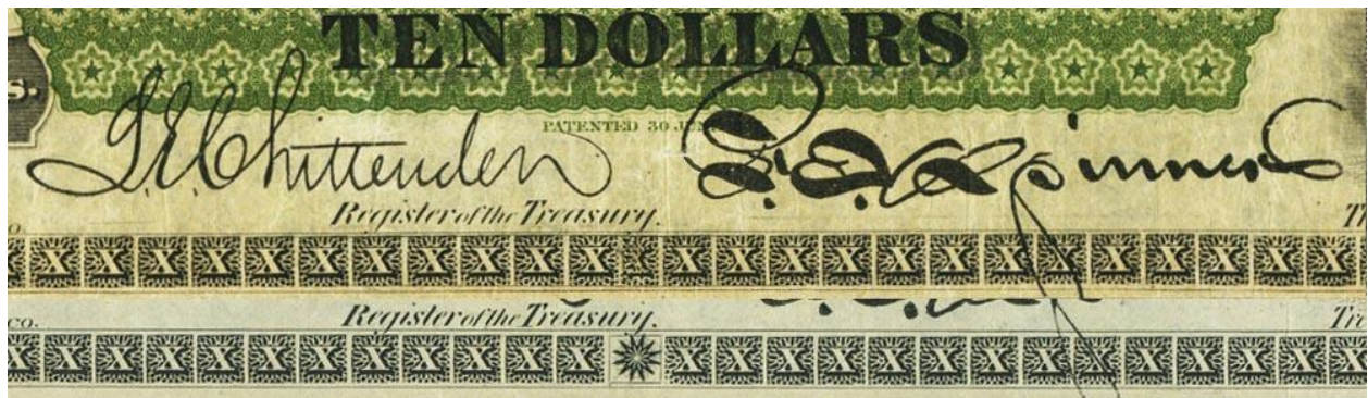
Figure 7. The bottom border of the $10s come without (top) and with (bottom) a starburst in the center.

The first six $10 plates were altered Demand Note plates. They have no starburst in the center of the lower border. Successive plates made exclusively for the legal tender issues incorporate the starburst. This detail applies only to the $10 notes and is listed in the column labeled "Special Characteristics."