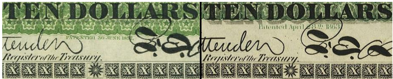
Figure 4. George Matthews' June 30, 1857 and Asahel K. Eaton's April 28, 1863 patent dates on 1862 and 1863 Legal Tender Notes were for anti-photographic green tint inks.

The green ink used to print the green tints on the faces of the notes were patented anti-counterfeiting inks. The patent holders claimed the green couldn't be removed without damaging the black intaglio printing and the paper, which would prevent counterfeiters from obtaining a sharp photographic image of the black overlay. The Treasury paid a royalty for the use of the inks, first for the Matthews and next for the Eaton formulas; however, neither worked. The patented inks were then dropped from use.