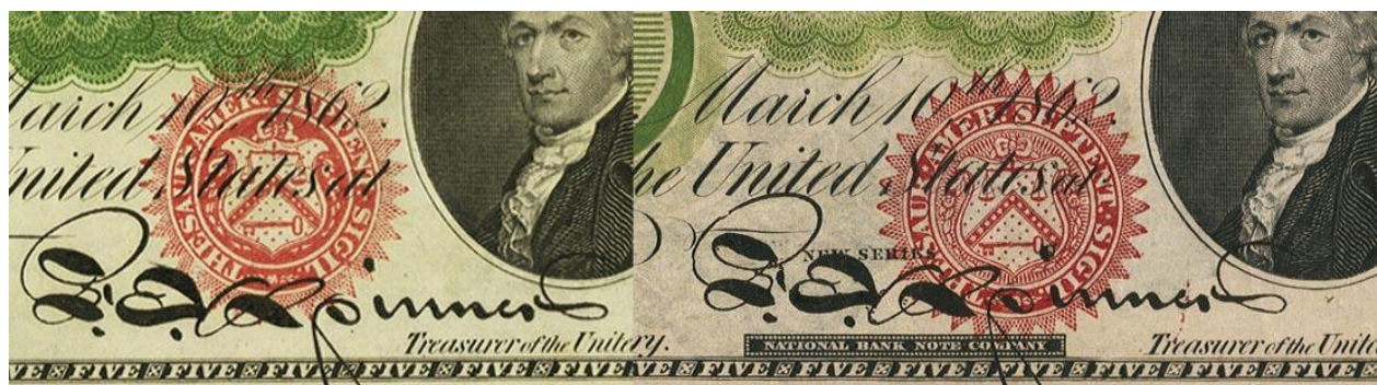
Figure 6. The background behind the shield is solid on the first seal (left).